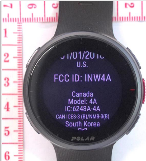
Figure 8. FCC ID & Canadian certificate ID.