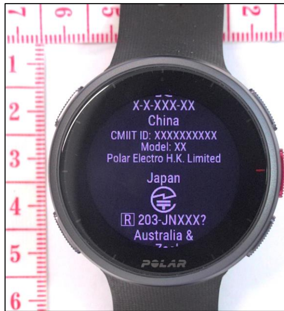
Figure 9. Template of Chinese certification ID.