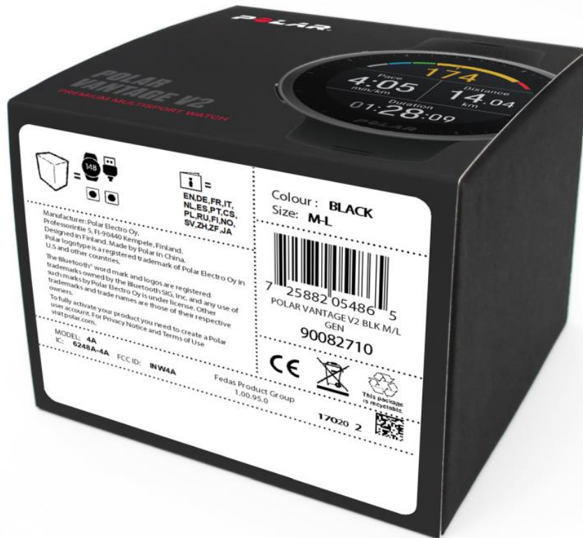
Figure 10. Sales box.