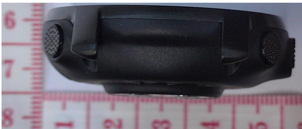
Figure 7. Device side view with wrist band fastening.