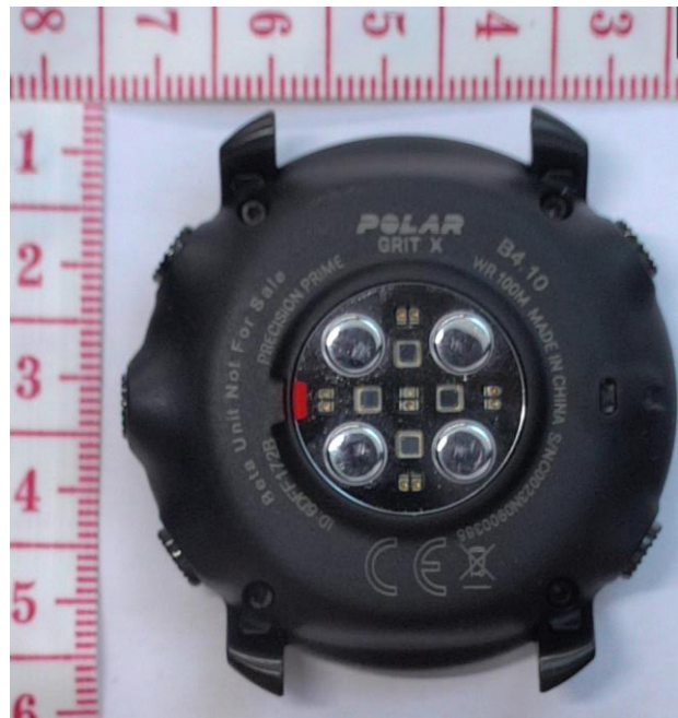
Figure 4. Device rear view.