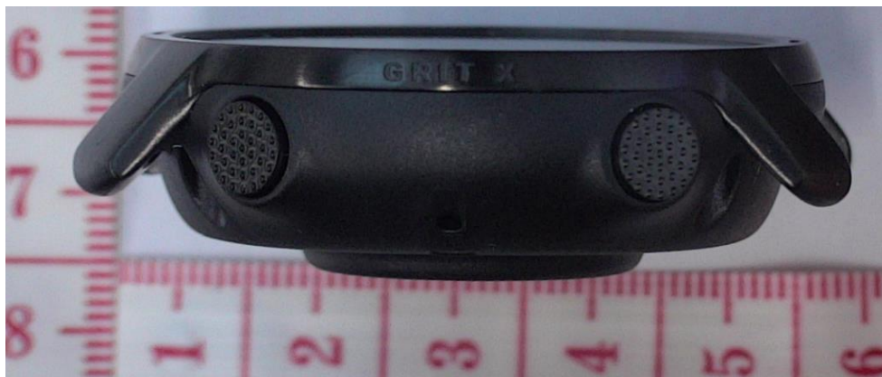
Figure 6. Device side view with two buttons.