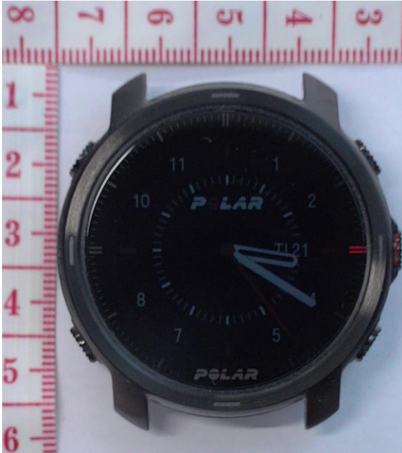
Figure 3. Device front view.