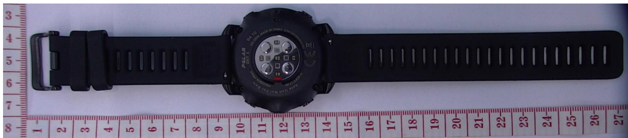
Figure 2. Device labelling.