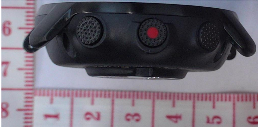
Figure 5. Device side view with three buttons.