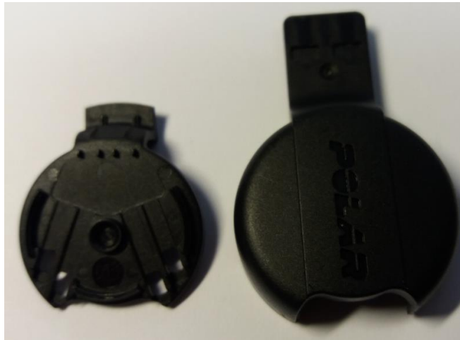
Figure 4. The two parts of the docking station.

Author: Pentti Pärnänen +358 (0)8 5202 100, pentti.parnanen@polar.com