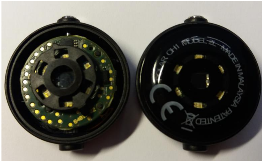
Figure 1. On the left, the device opened, the plastic cover removed.

Author: Pentti Pärnänen +358 (0)8 5202 100, pentti.parnanen@polar.com