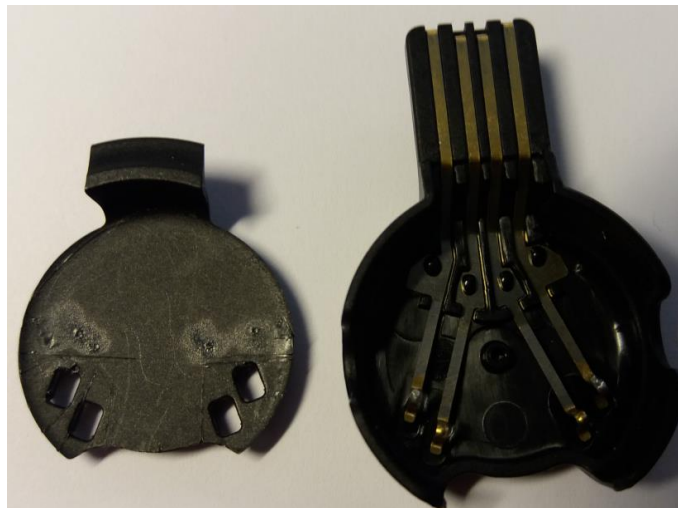
Figure 5. The two parts of the docking station from other side.