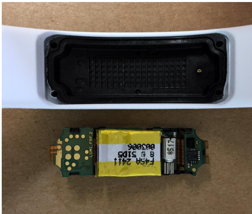
Figure 2. Electronics module removed from the front cover.