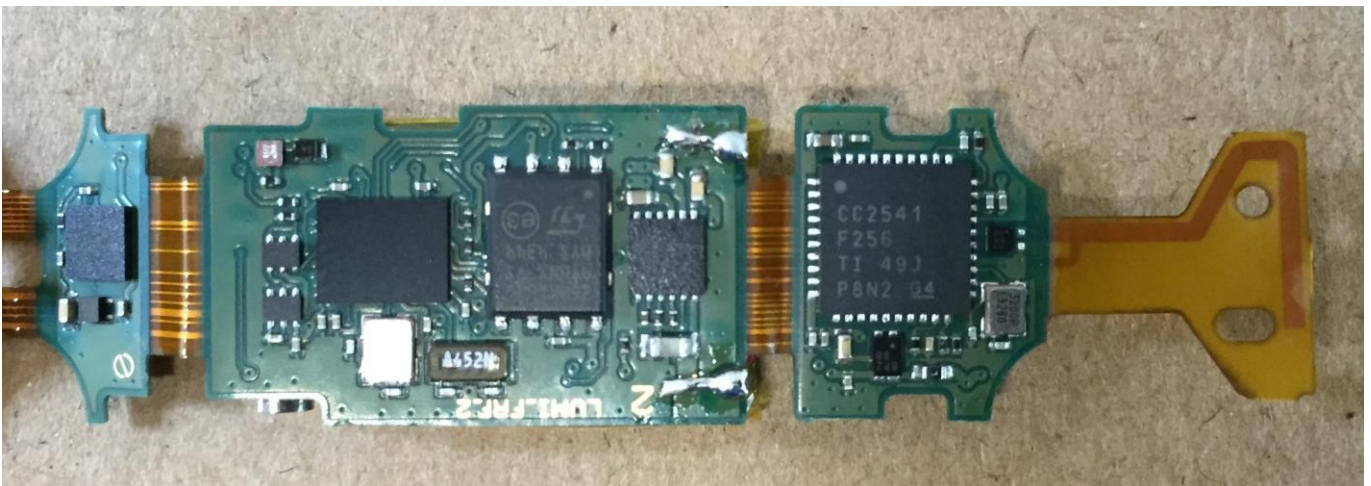
Figure 8. PWB component placement.