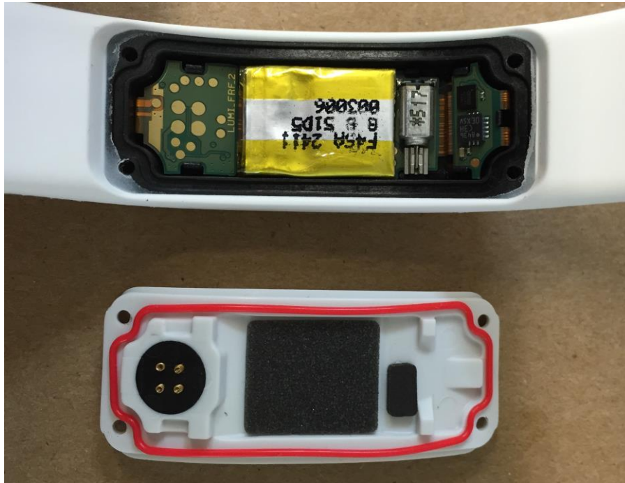
Figure 1. Back cover opened.

Author: Antti Häggman +358 (0)8 5202 100, antti.haggman@polar.com