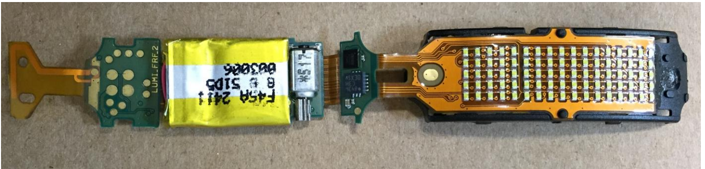
Figure 6. Electronics module folded open,

Author: Antti Häggman +358 (0)8 5202 100, antti.haggman@polar.com