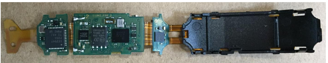
Figure 7. Electronics module folded open, inside.