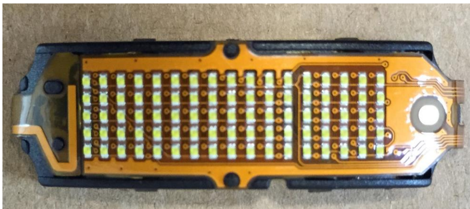
Figure 5. Electronics module from the top side.