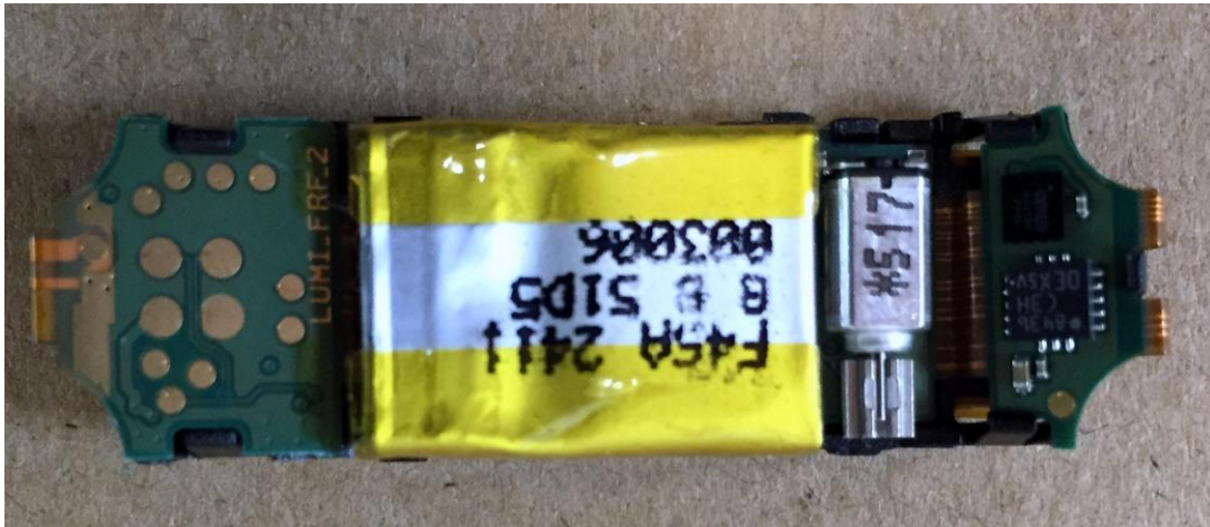
Figure 3. Electronics module from the bottom side.

Author: Antti Häggman +358 (0)8 5202 100, antti.haggman@polar.com