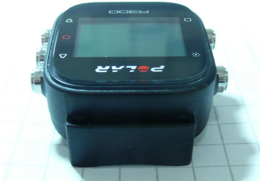
Figure 10. Device module from upper side.