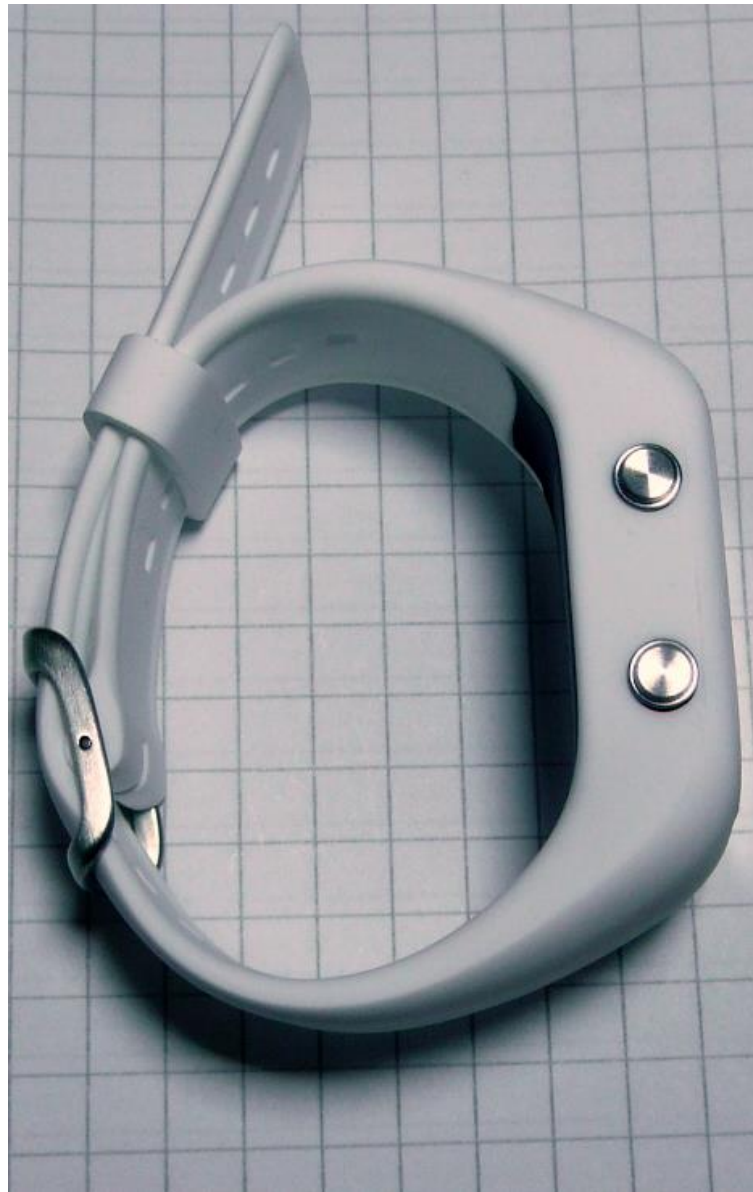
Figure 3. Left side.

Author: Antti Häggman +358 (0)8 5202 100, antti.haggman@polar.com