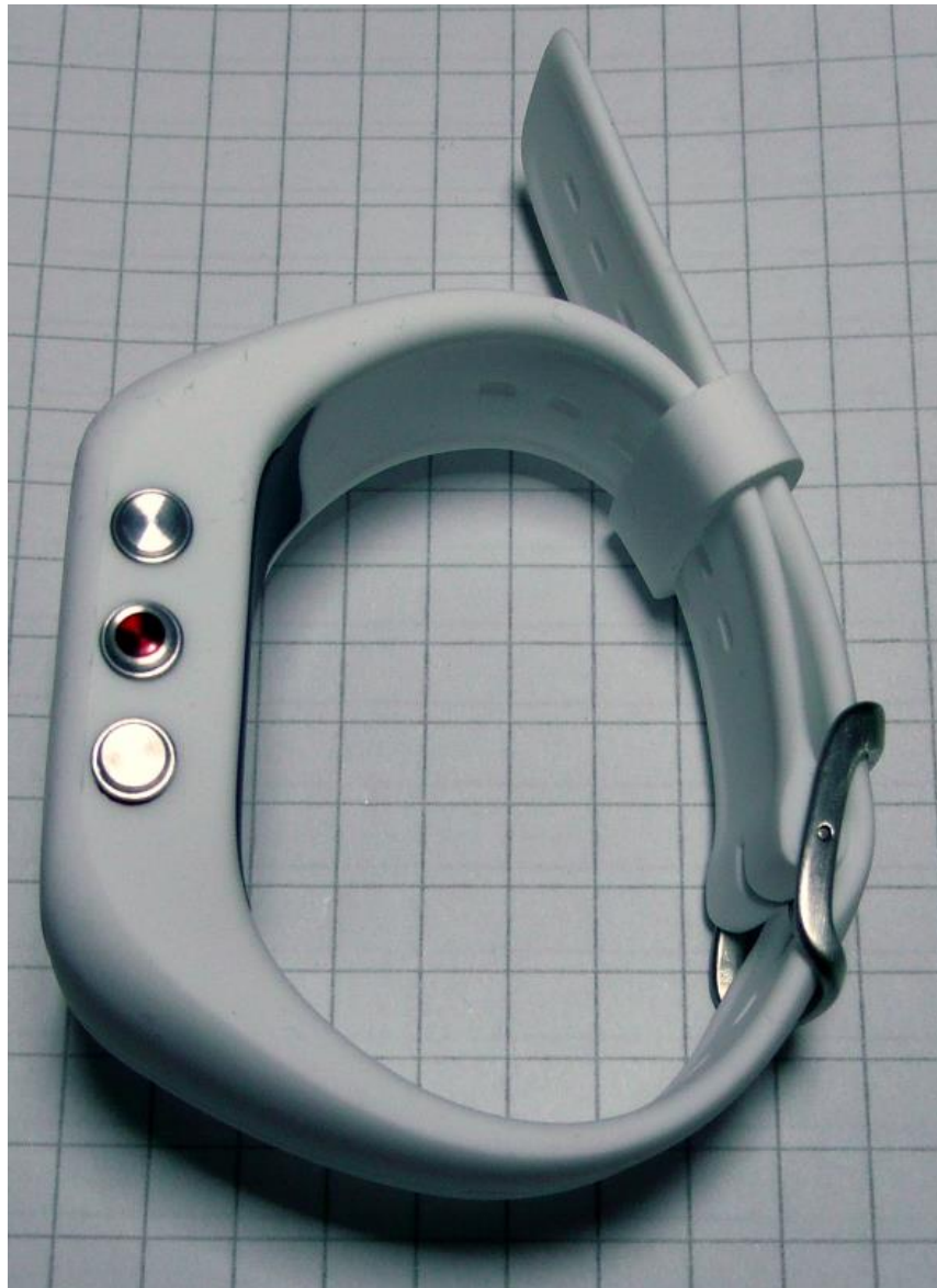
Figure 4. Right side

Author: Antti Häggman +358 (0)8 5202 100, antti.haggman@polar.com