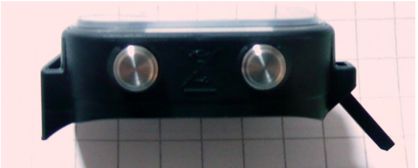
Figure 7. Left side of the device module.

Author: Antti Häggman +358 (0)8 5202 100, antti.haggman@polar.com