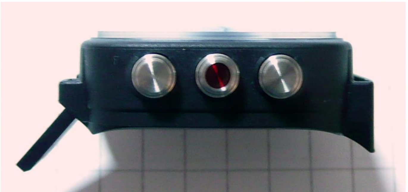
Figure 8. Right side of the device module.