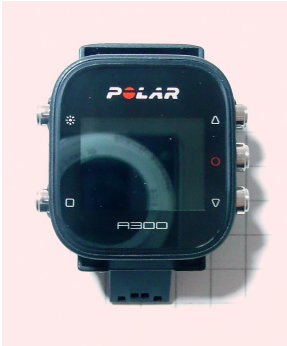
Figure 5. Device module front face (wrist straps removed).

Author: Antti Häggman +358 (0)8 5202 100, antti.haggman@polar.com