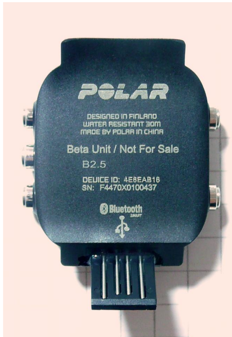
Figure 6. Device module back side.

Author: Antti Häggman +358 (0)8 5202 100, antti.haggman@polar.com