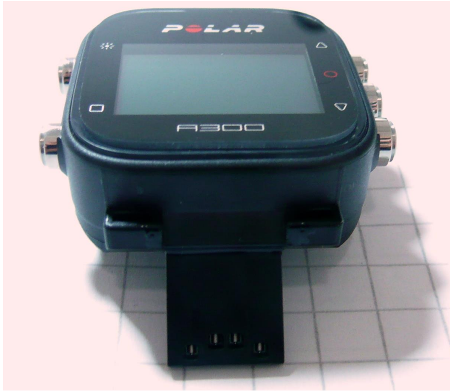
Figure 9. Device module from the USB connector side.

Author: Antti Häggman +358 (0)8 5202 100, antti.haggman@polar.com