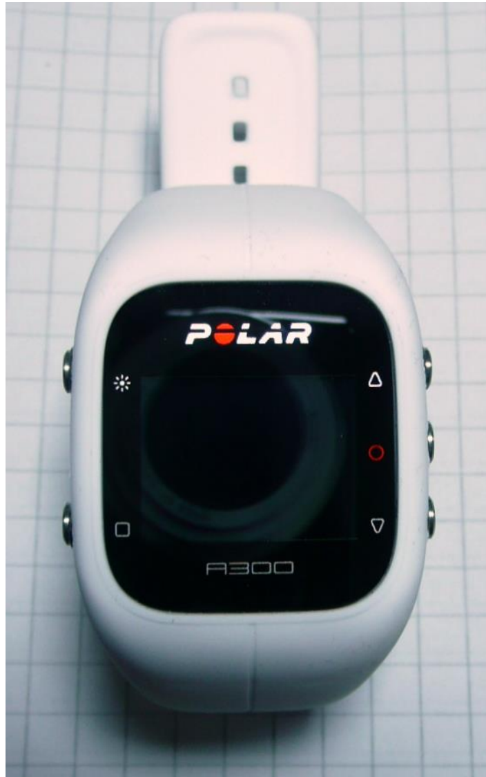
Figure 1. Device front face.

Author: Antti Häggman +358 (0)8 5202 100, antti.haggman@polar.com