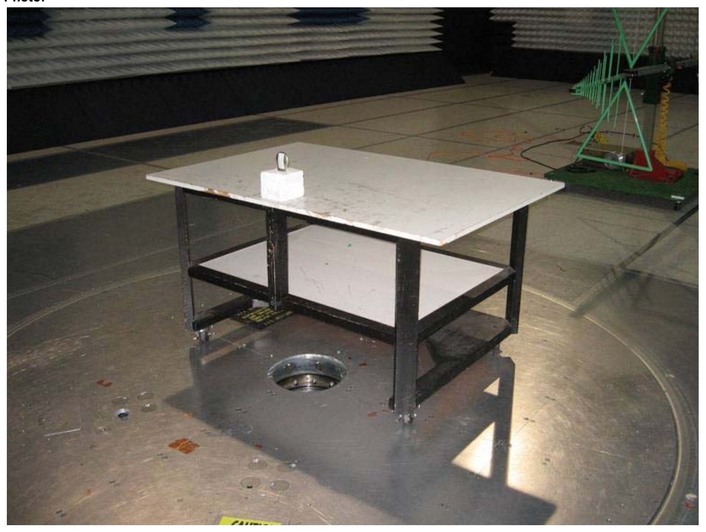
Test Setup - Rear View