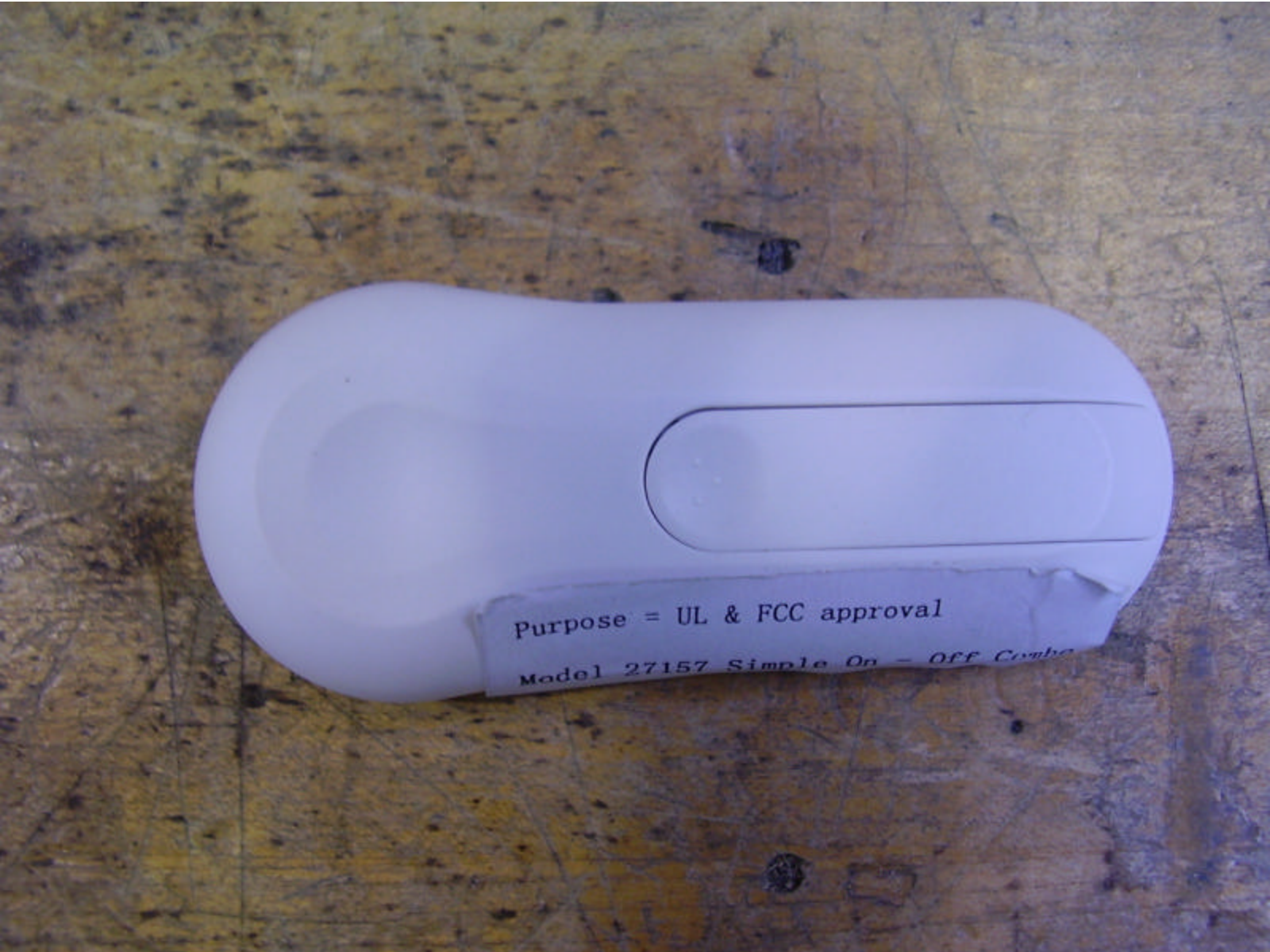
Model 27157 Transmitter (FCC ID: IN2TX26, IC: 3558A-TX26) – Rear