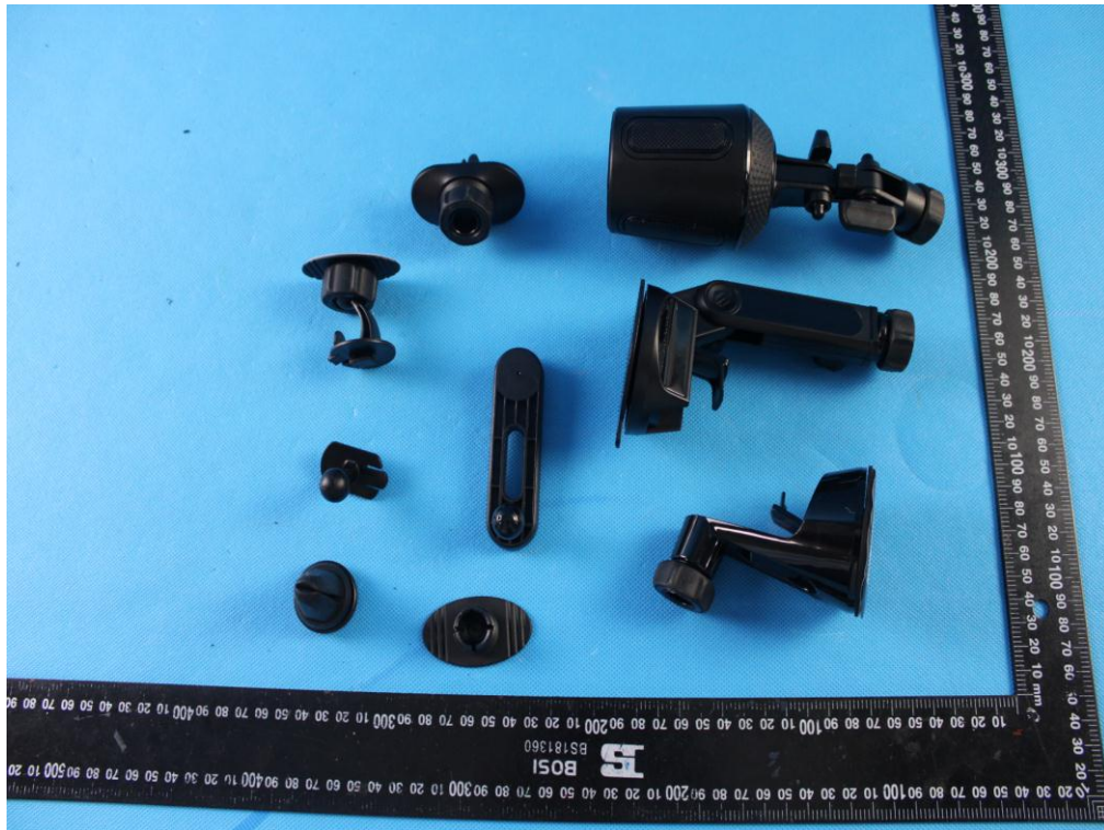
All VIEW OF EUT (FIGURE 2)