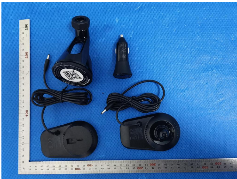
WHOLE VIEW OF EUT(MPQ5DV-XTSP)