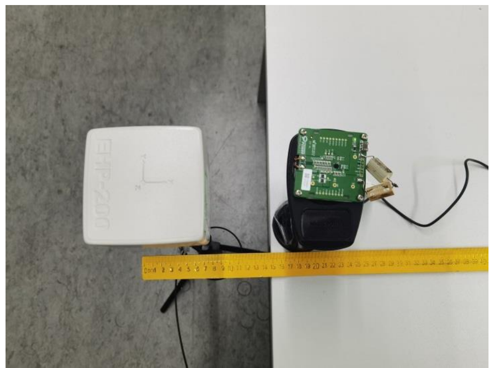
RF exposure test