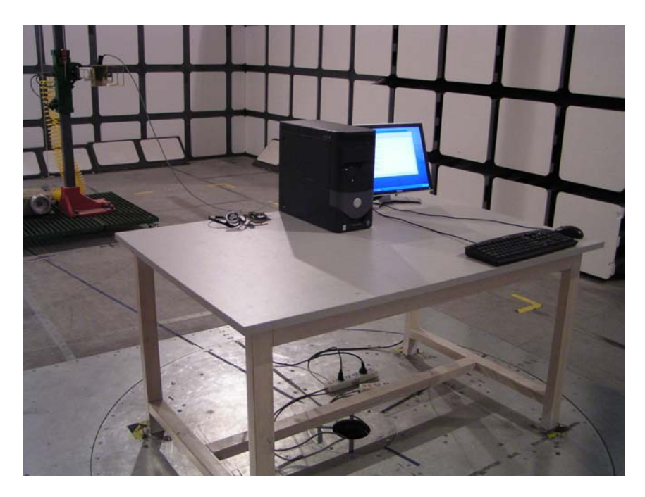
Radiated Emissions – Rear View (Above 1GHz)