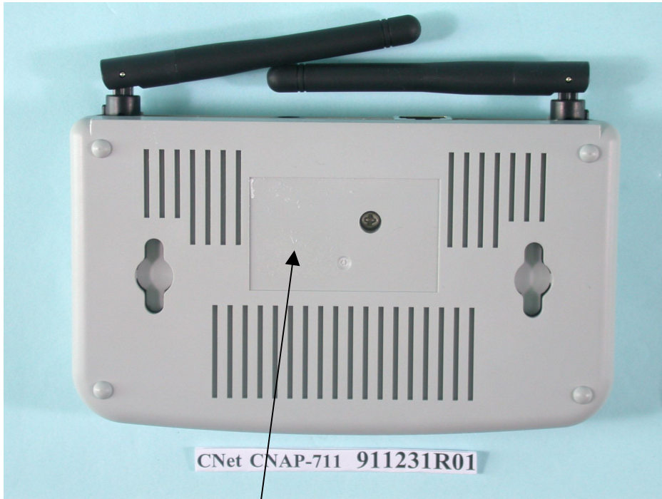
FCC ID Label Location