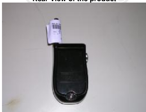
Rear View of the product