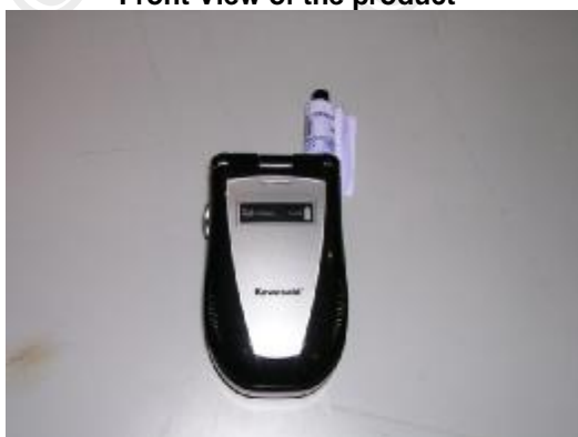
Front View of the product