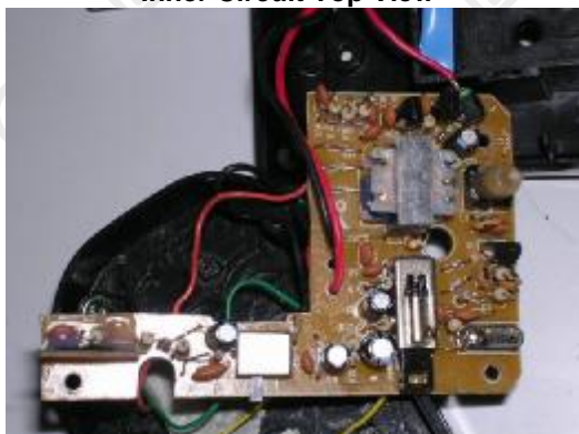
Inner Circuit Top View