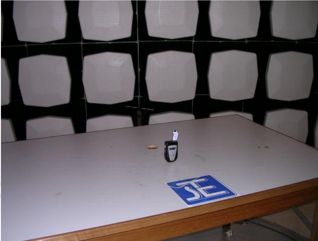
Measurement of Radiated Emission Test Set Up