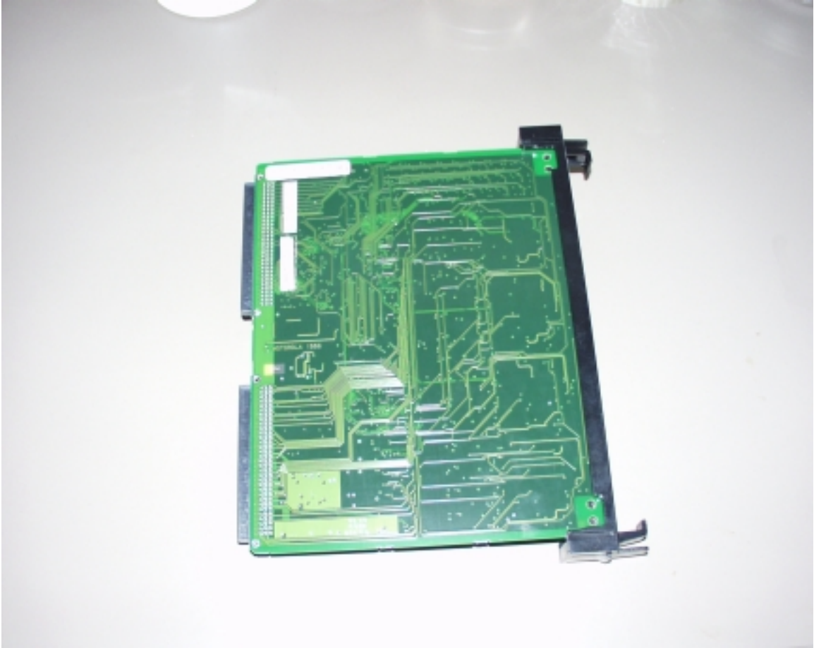
IHET6BV1 HorizonMacro1900 Alarm Board Bottom View