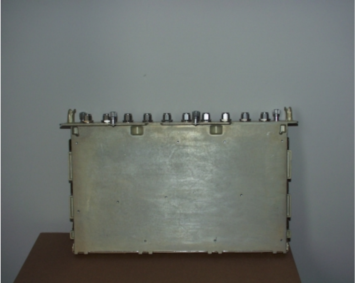
IHET6BV1 HorizonMacro1900 SURF Front View