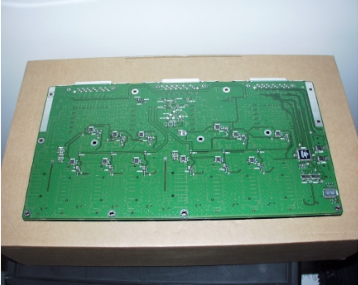
IHET6BV1 HorizonMacro1900 SURF Board Bottom View