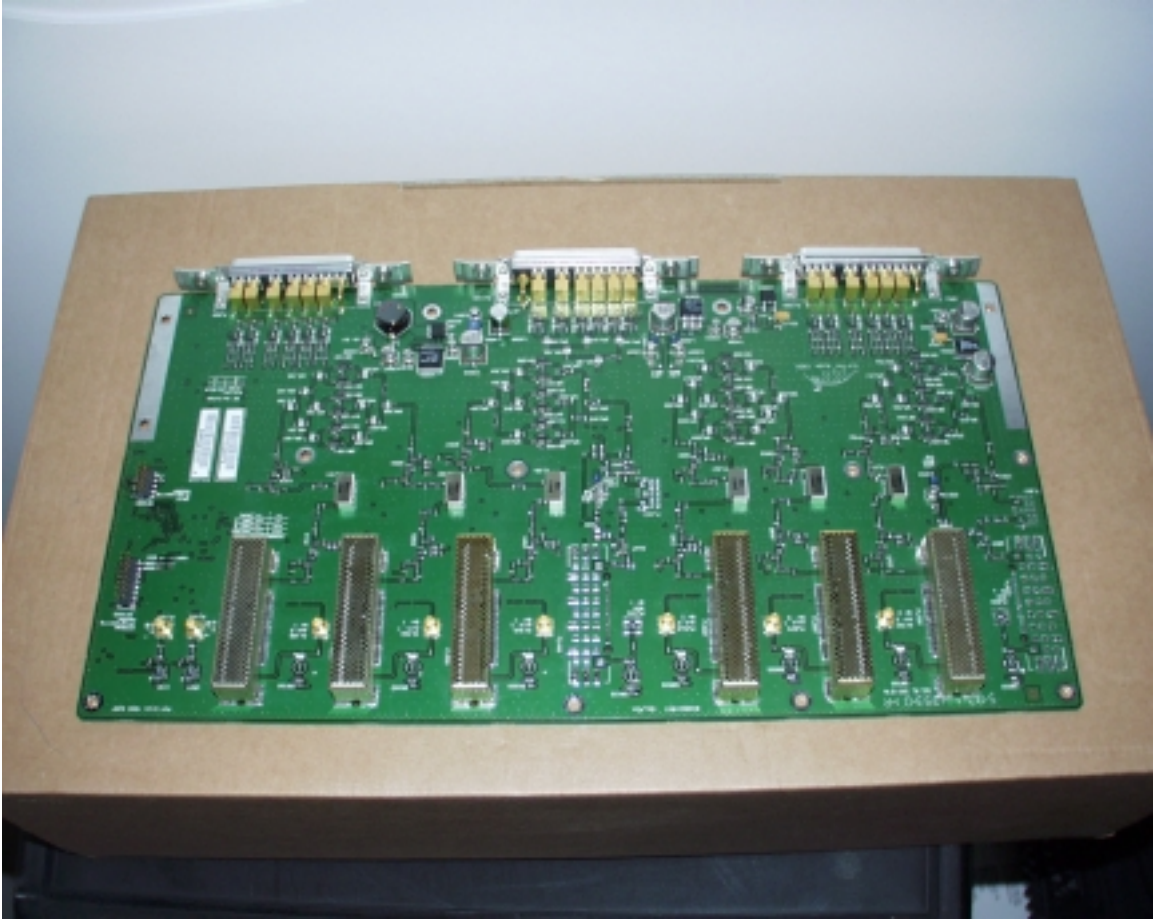
IHET6BV1 HorizonMacro1900 SURF Board Top View