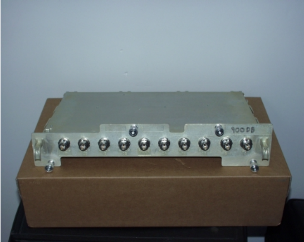
IHET6BV1 HorizonMacro1900 SURF Top View