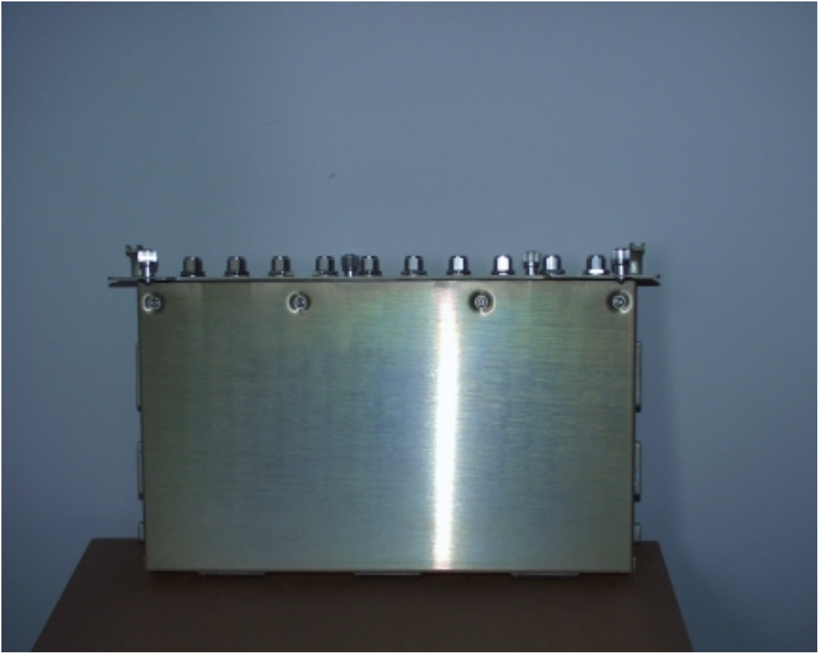
IHET6BV1 HorizonMacro1900 SURF Rear View