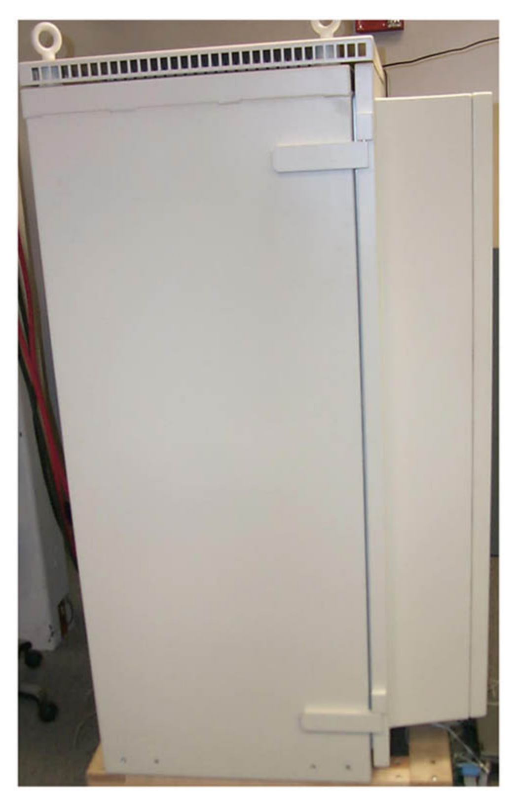
IHET5BR1 SC4812ET Lite 800 MHz Right Side View