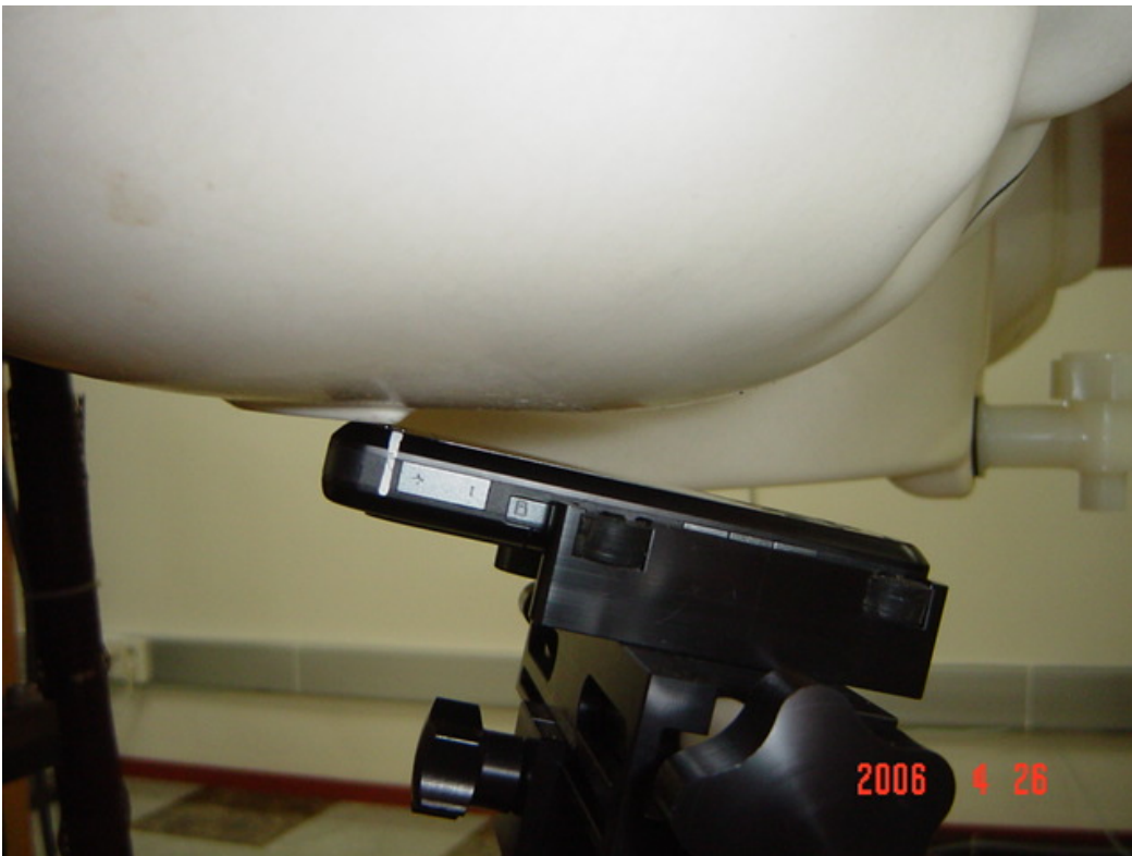
Figure 4: Tilt Position