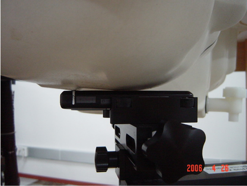
Figure 3: Cheek/Touch Position