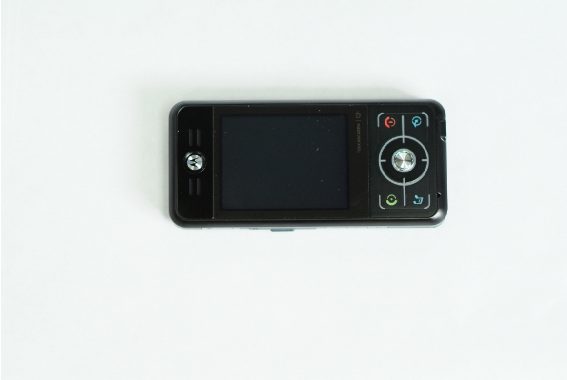
Figure 1: Front of Phone