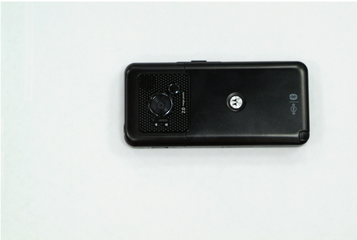
Figure 2: Back of Phone