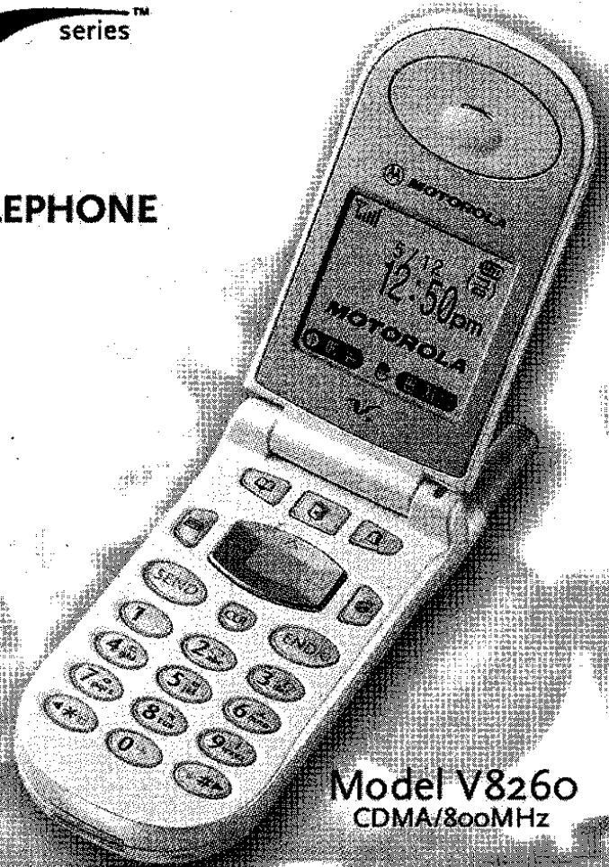
Model V8260 CDMA/800MHz