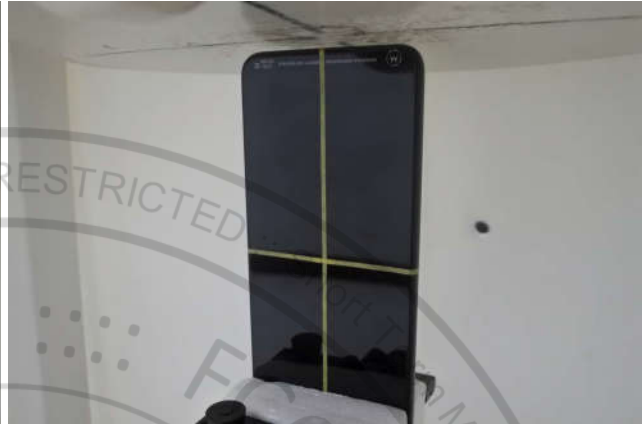
Bottom Side, Test Separation 5 mm