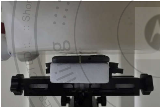
Back, Test Separation 5 mm