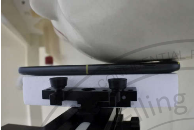
Left Cheek, Test Separation 0 mm