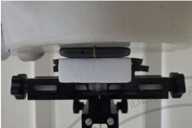
Front, Test Separation 0 mm