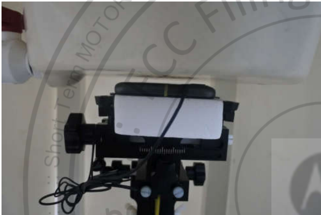
Back with headset, Test Separation 5 mm