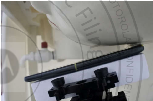
Left Tilted, Test Separation 0 mm