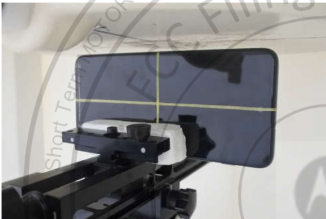
Left Side, Test Separation 5 mm