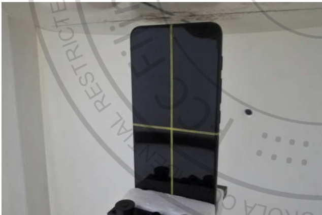
Top Side, Test Separation 5 mm