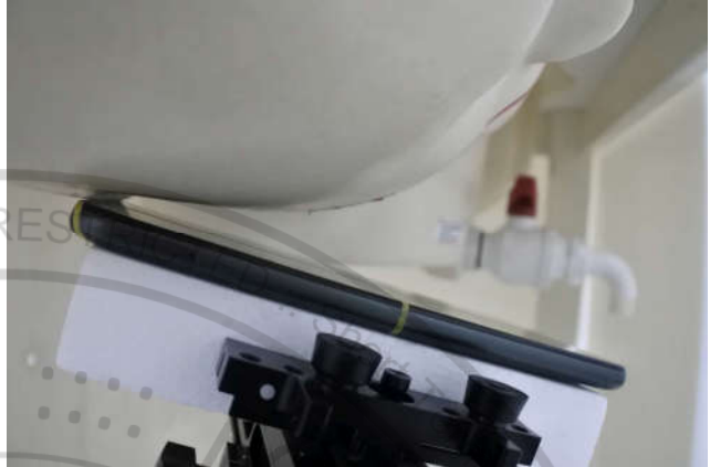
Right Tilted, Test Separation 0 mm