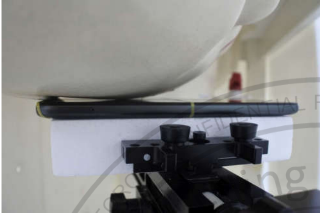
Right Cheek, Test Separation 0 mm