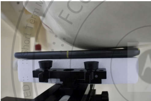
Left Cheek, Test Separation 0 mm