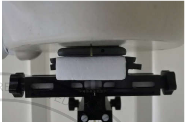
Back, Test Separation 0 mm