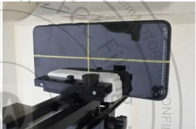
Right Side, Test Separation 5 mm