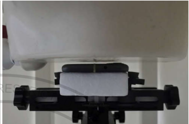
Back, Test Separation 5 mm