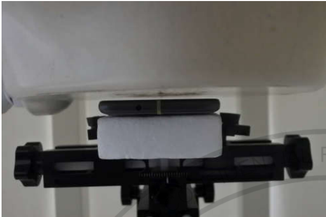
Front, Test Separation 5 mm