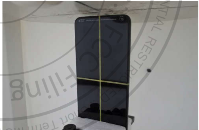
Bottom Side, Test Separation 5 mm