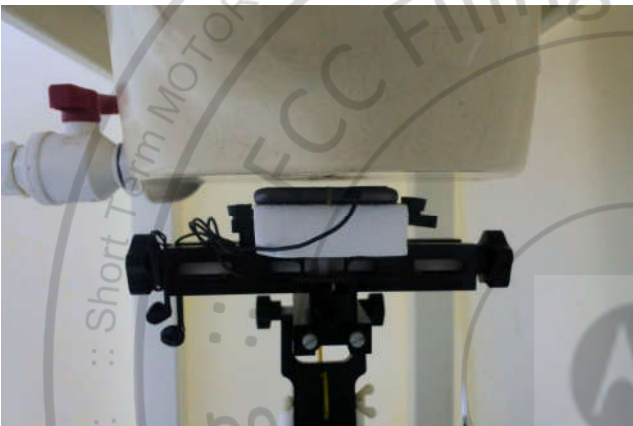
Back with handset, Test Separation 5 mm