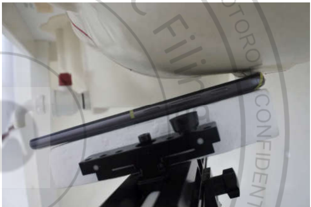
Left Tilted, Test Separation 0 mm