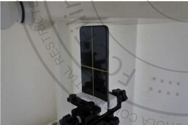
Top Side, Test Separation 5 mm