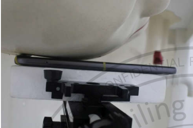
Right Cheek, Test Separation 0 mm