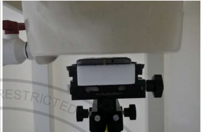
Back, Test Separation 5 mm