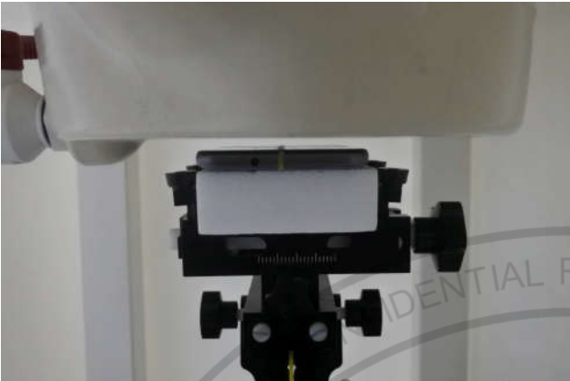
Front, Test Separation 5 mm