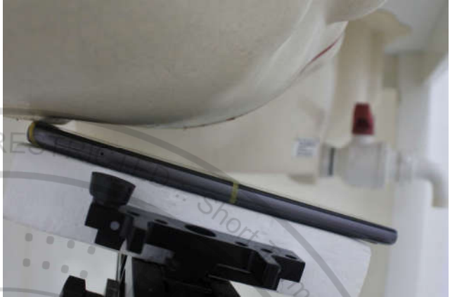
Right Tilted, Test Separation 0 mm