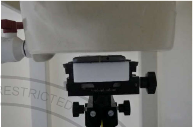
Back, Test Separation 5 mm