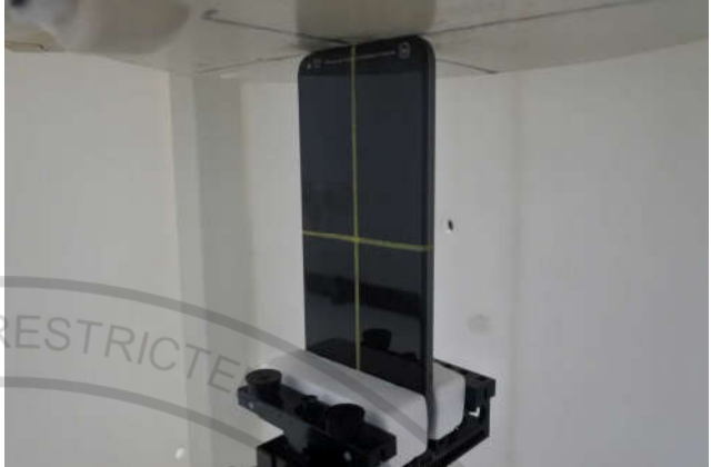
Bottom Side, Test Separation 0 mm