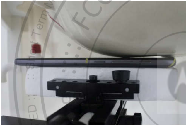
Left Cheek, Test Separation 0 mm