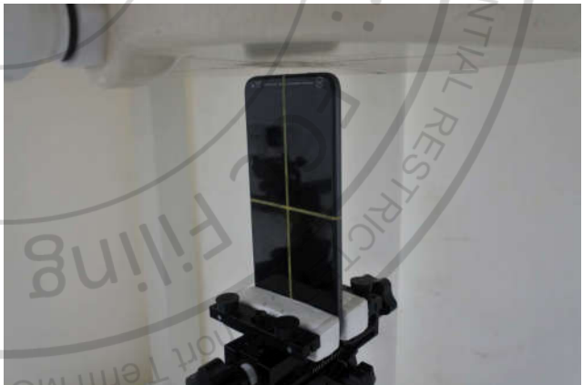
Bottom Side, Test Separation 5 mm