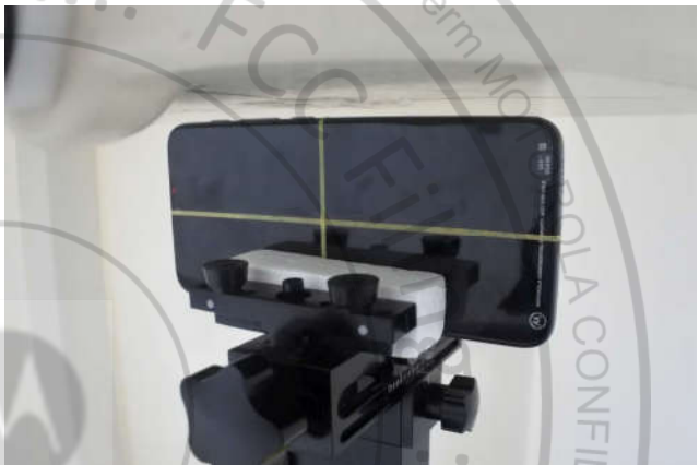
Right Side, Test Separation 5 mm