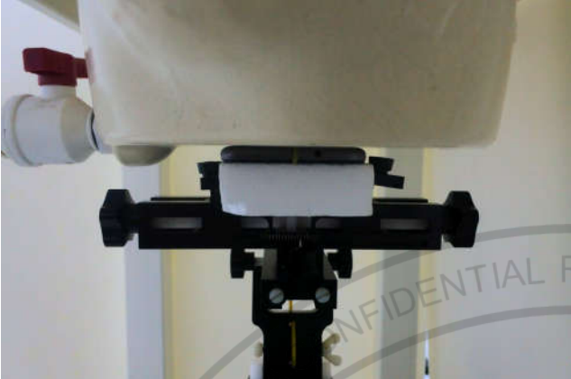
Back, Test Separation 0 mm