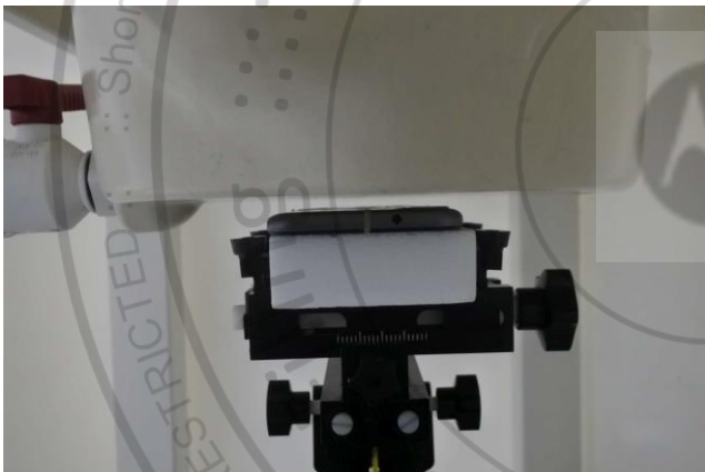
Back, Test Separation 5 mm