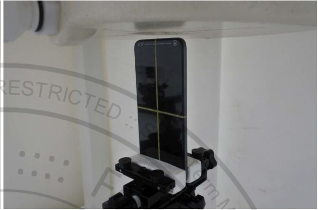
Bottom Side, Test Separation 5 mm