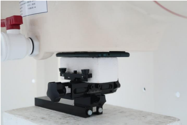
Back, Test Separation 0 mm