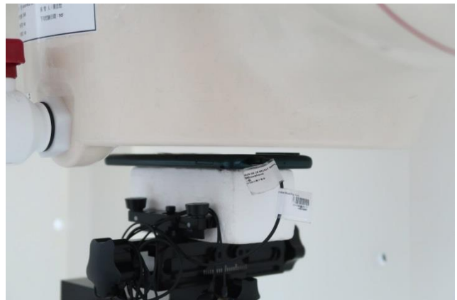
Back with Headset, Test Separation 5 mm