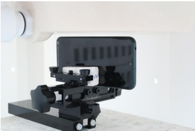
Left, Test Separation 5 mm