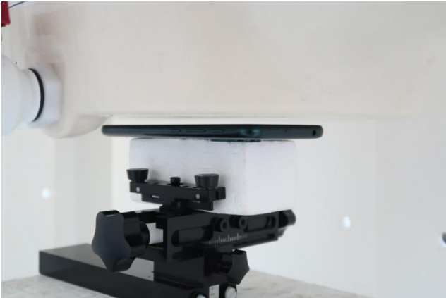
Front, Test Separation 5 mm