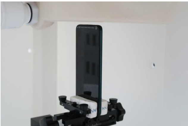
Bottom Side, Test Separation 5 mm