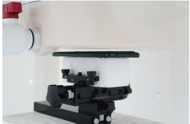
Back, Test Separation 5 mm