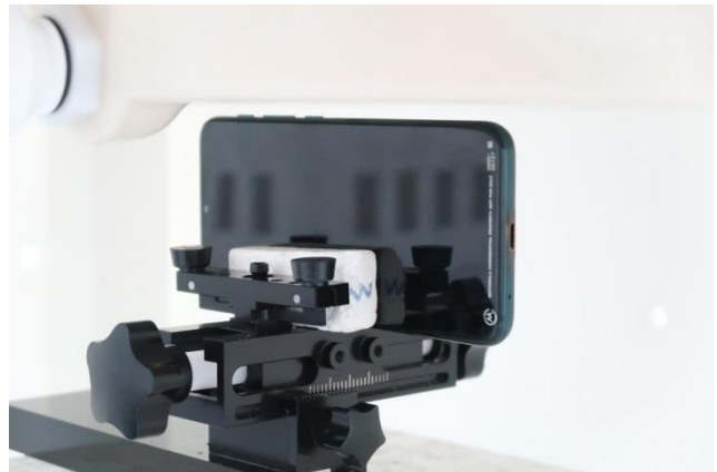
Right, Test Separation 5 mm