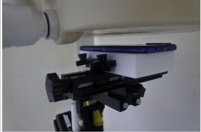
Back, Test Separation 19 mm