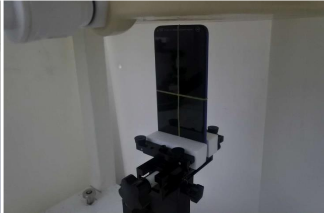
Bottom Side, Test Separation 6 mm