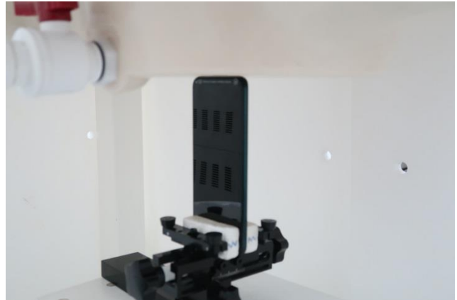
Bottom Side, Test Separation 0 mm