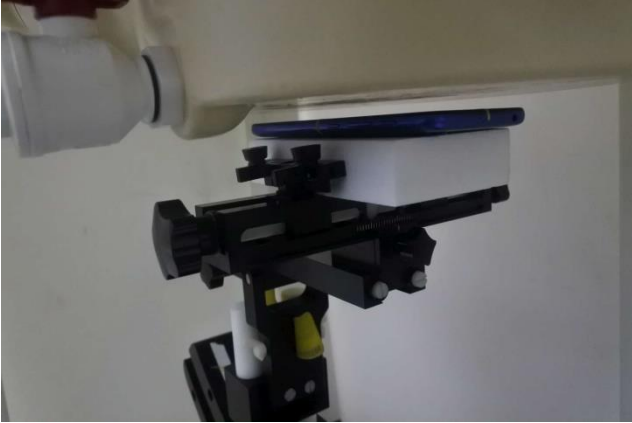
Front, Test Separation 9 mm