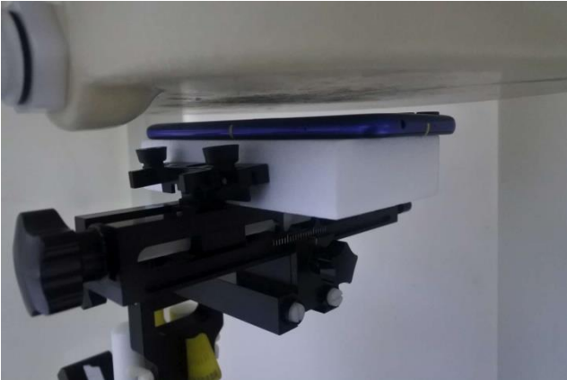
Back, Test Separation 9 mm