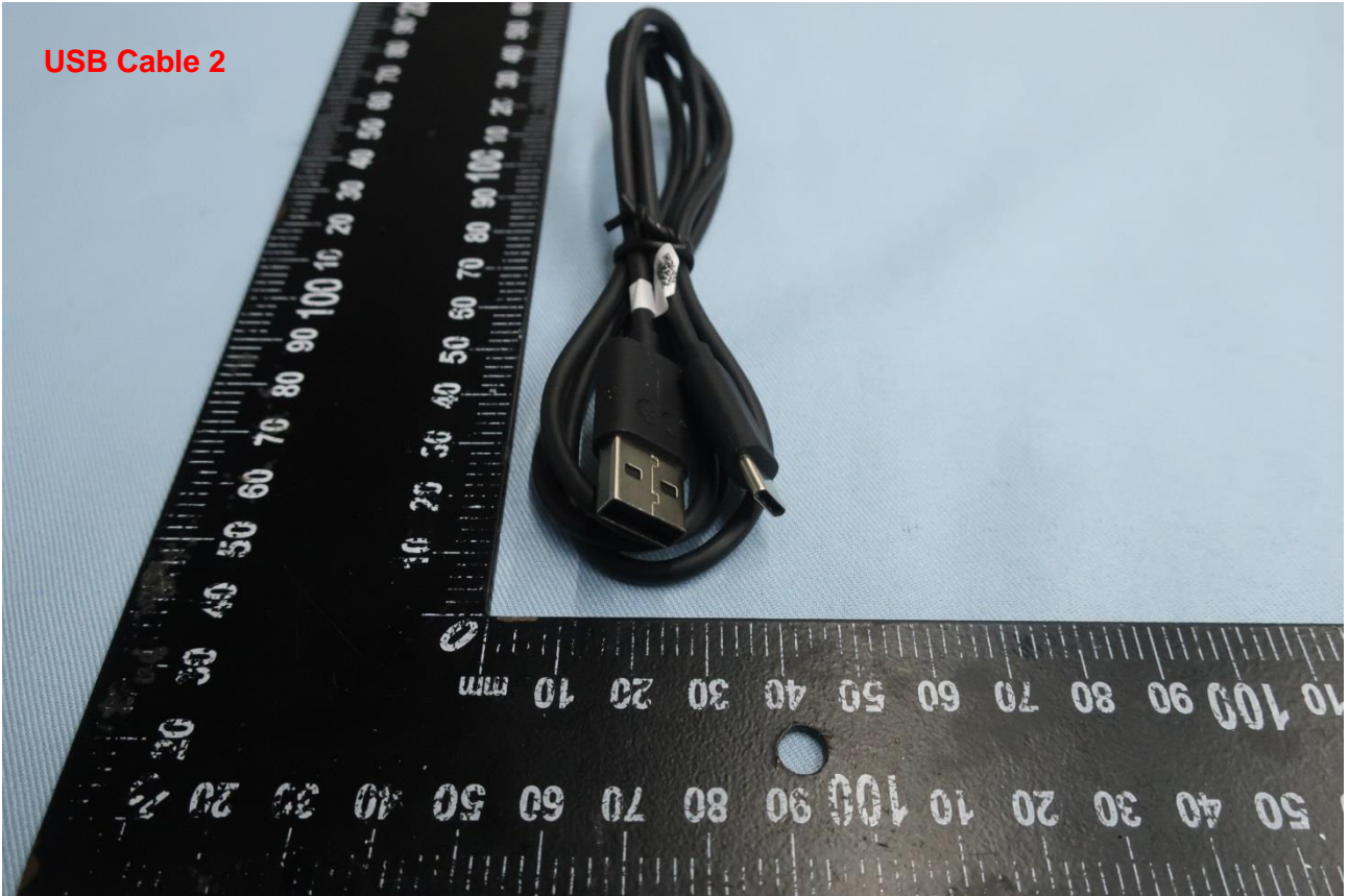
USB Cable 2

Brand Name: Motorola / Model Name: XT2045-3