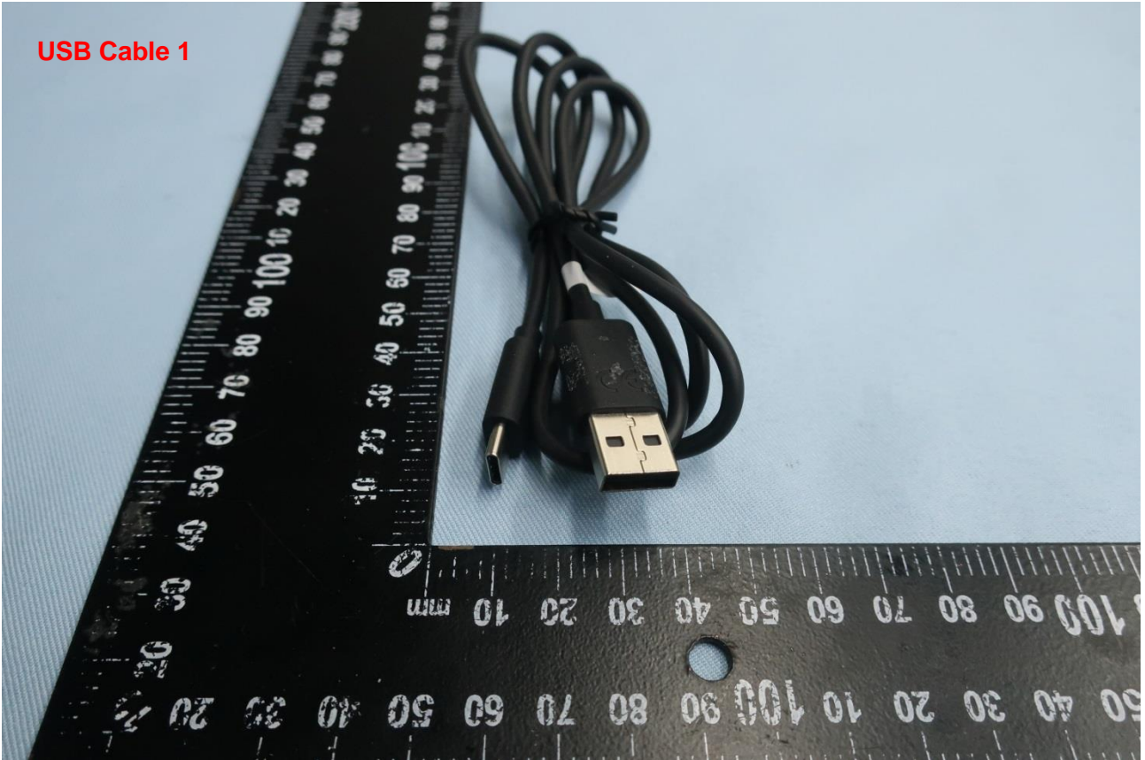
USB Cable 1

Brand Name: Motorola / Model Name: XT2045-3