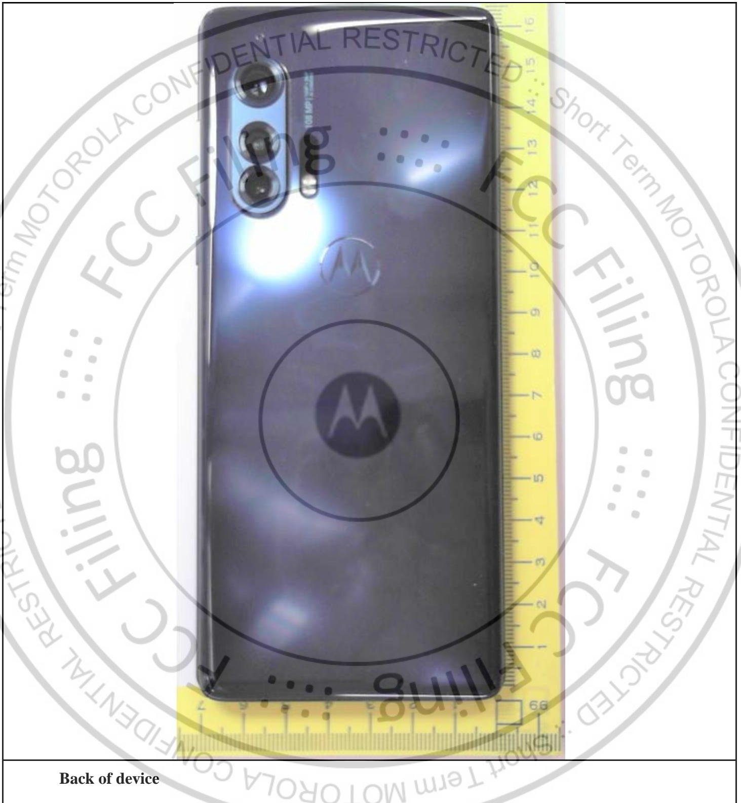
Back of device