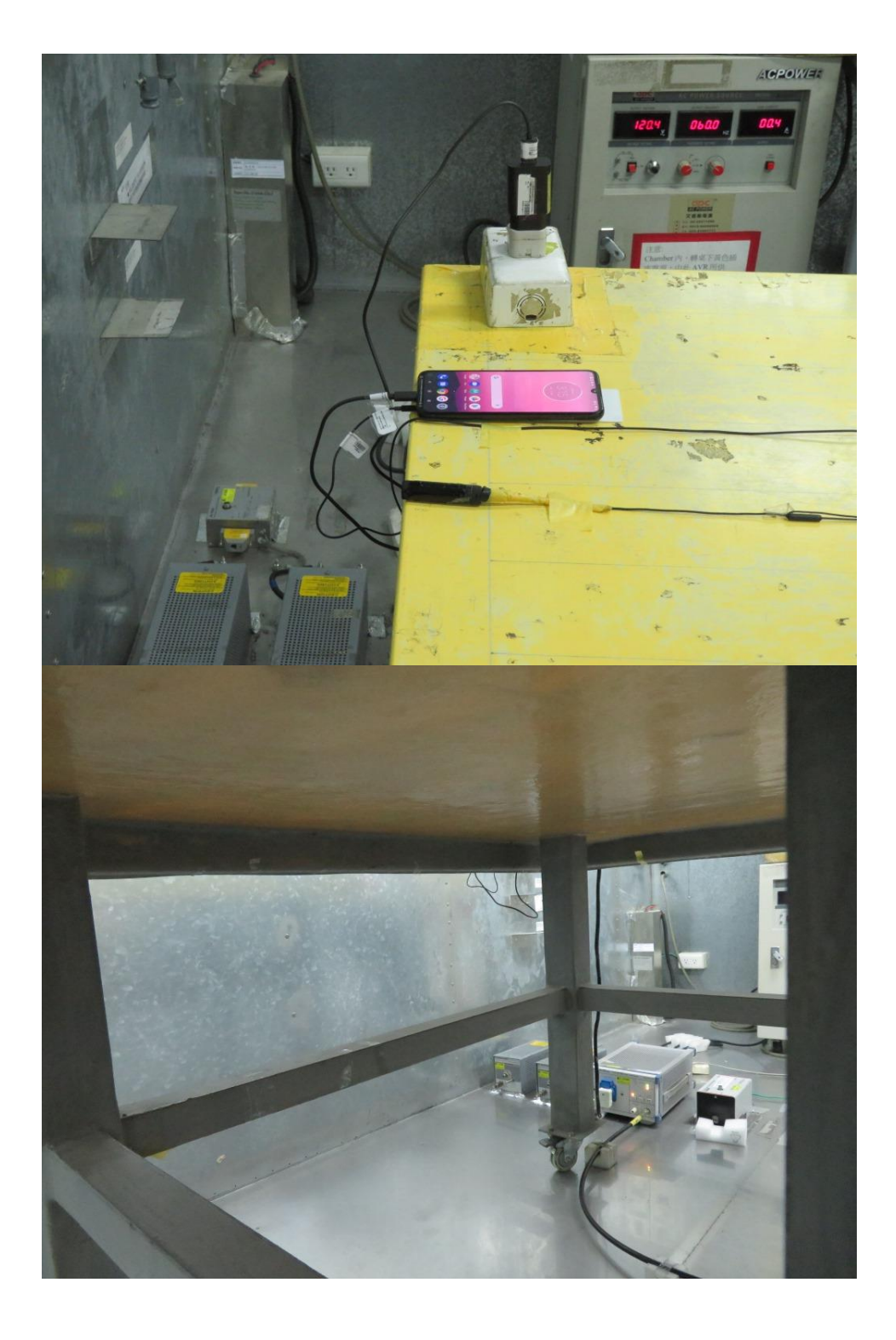
Exhibit 7 Report No. : FR942629D