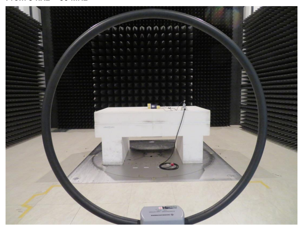
From 30 MHz ~ 1 GHz