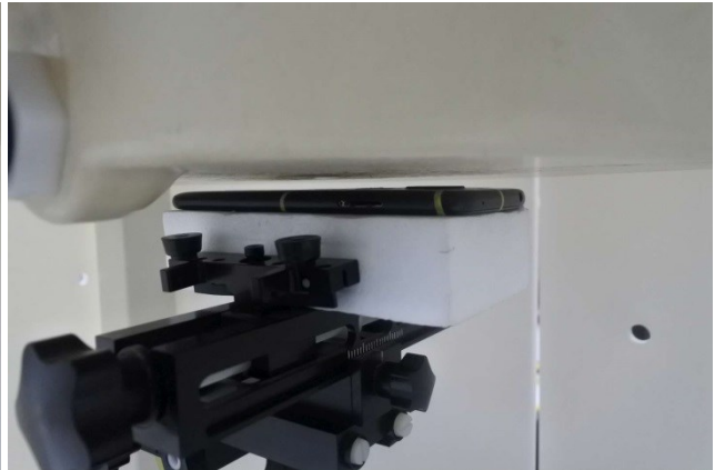
Back, Test Separation 5 mm