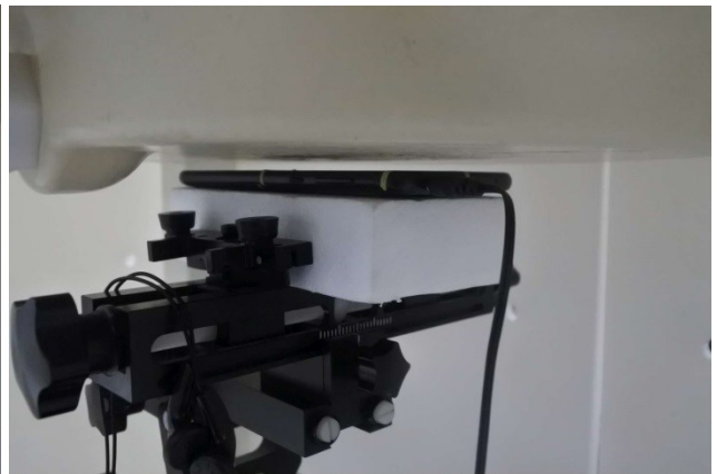
Front with handset, Test Separation 5 mm