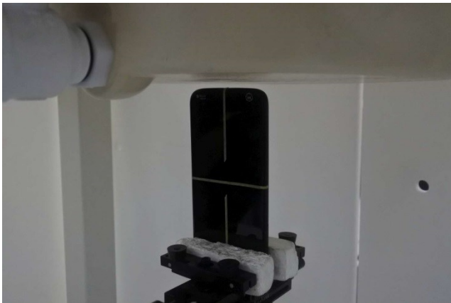
Bottom Side, Test Separation 5 mm