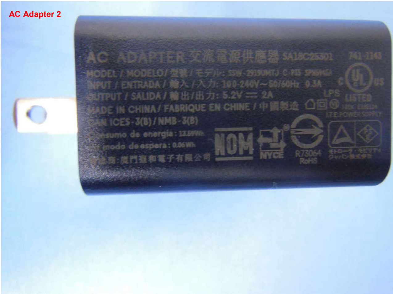
AC Adapter 2

Brand Name: Motorola / Model Name: XT1920DL