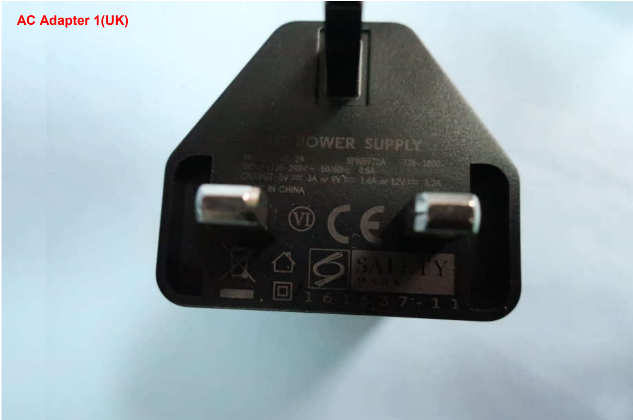
AC Adapter 1(UK)

Brand Name: Motorola; Model Name: XT1925-5, XT1925-4