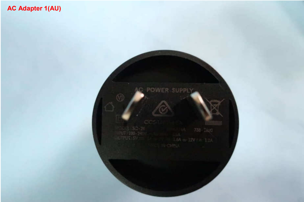
AC Adapter 1(AU)

Brand Name: Motorola; Model Name: XT1925-5, XT1925-4