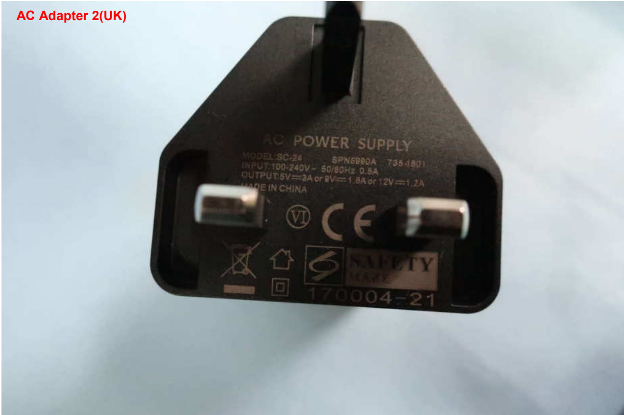
AC Adapter 2(UK)

Brand Name: Motorola; Model Name: XT1925-5, XT1925-4