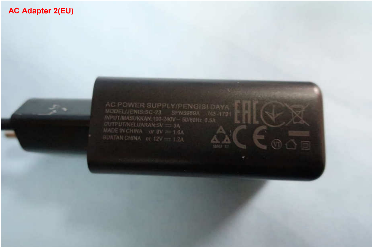
AC Adapter 2(EU)

Brand Name: Motorola; Model Name: XT1925-5, XT1925-4