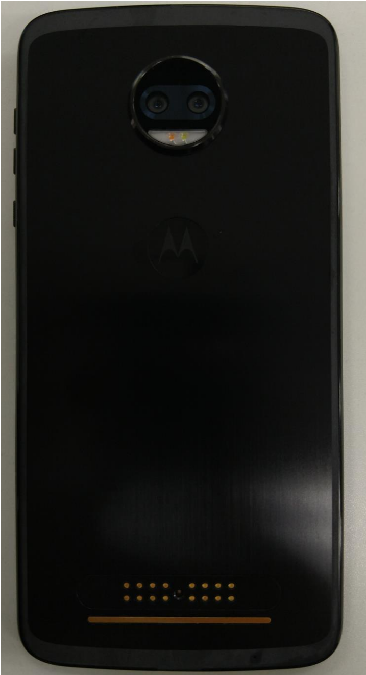
Photograph 3-2: Back of device