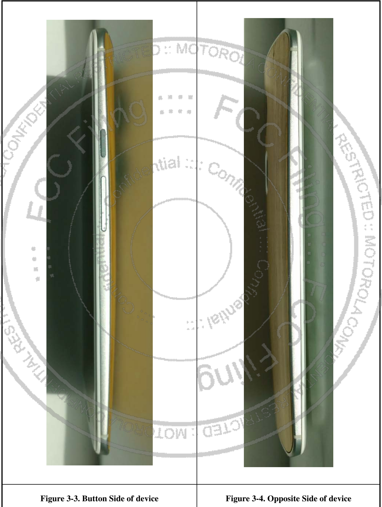
Figure 3-3. Button Side of device