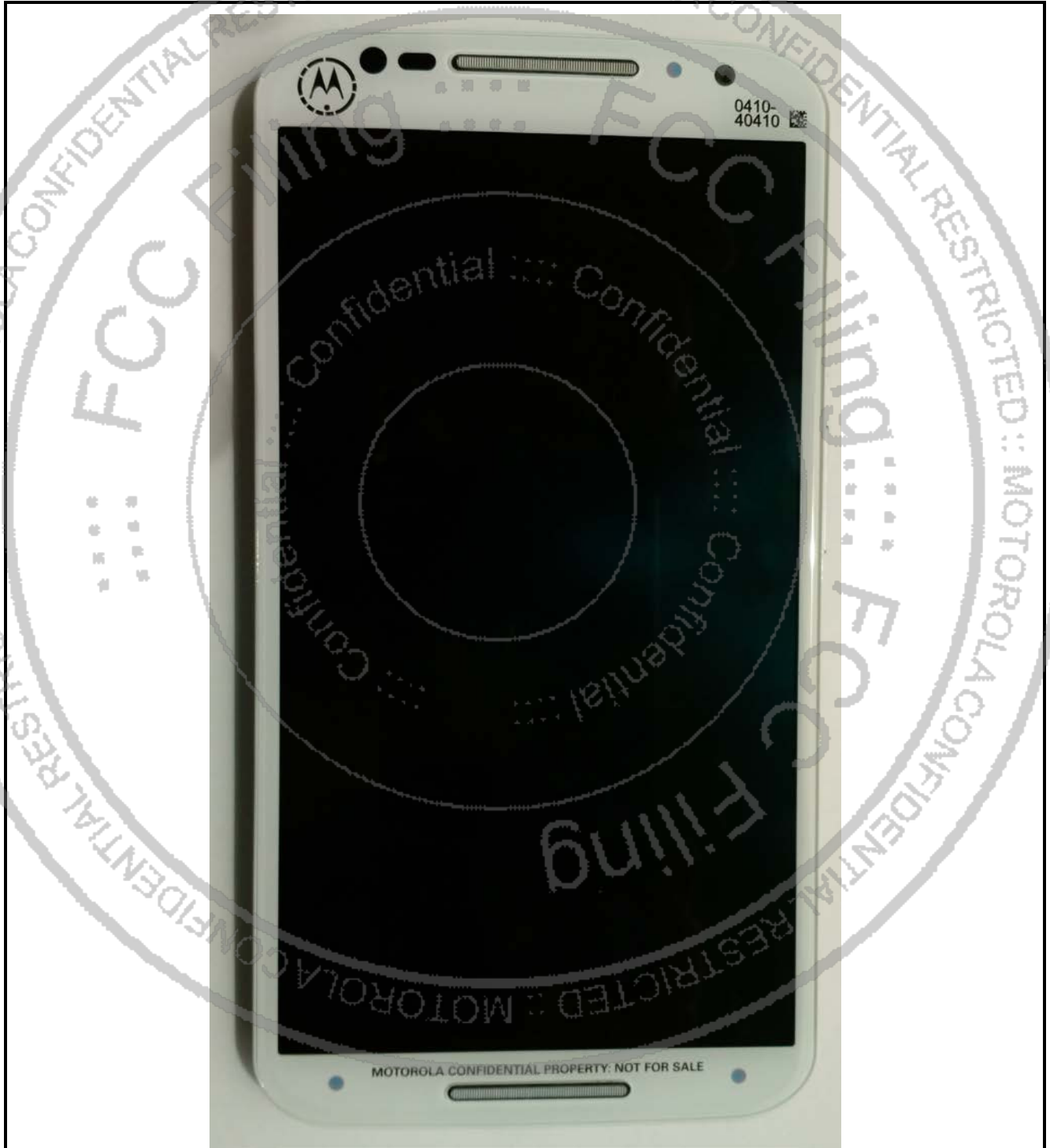
Figure 3-1. Front of device

The radio product colors, housings/bezels may vary, but only consistent with the requirements of FCC Class I Permissive Change rules and guidance (47 CFR 2.1043 and KDB 178919 D01).