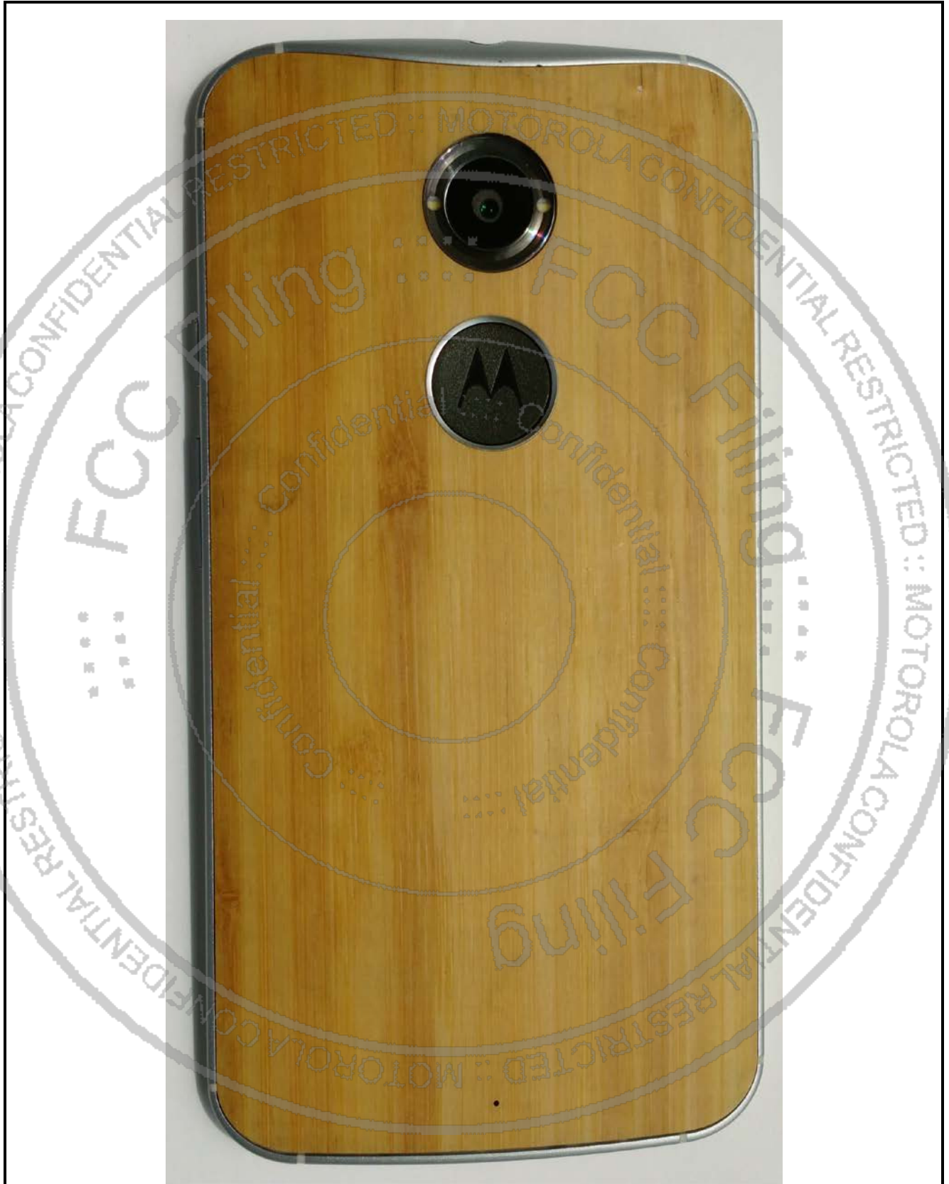
Figure 3-2. Back of device