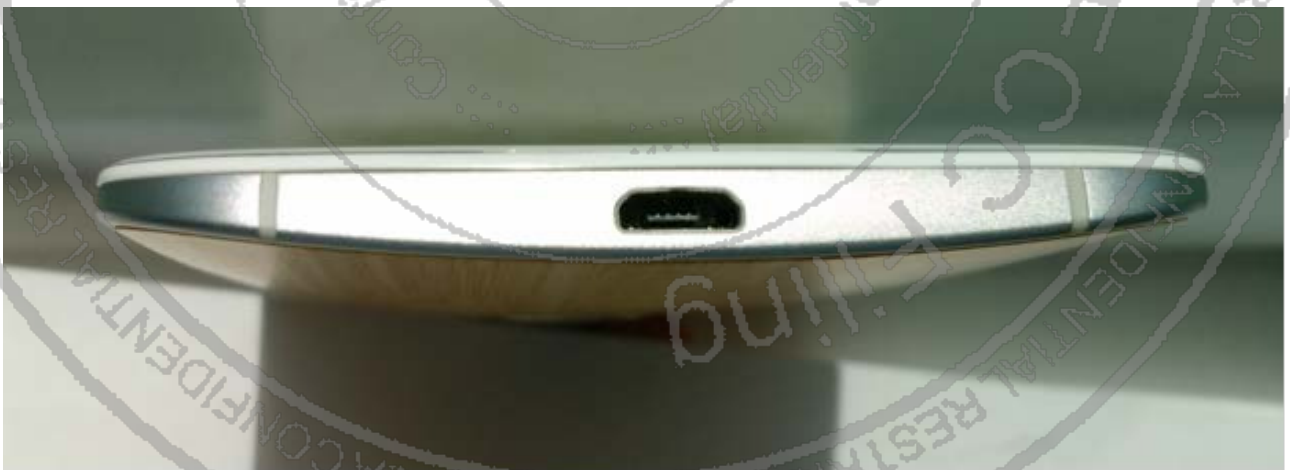
Figure 3-6. Bottom of radio