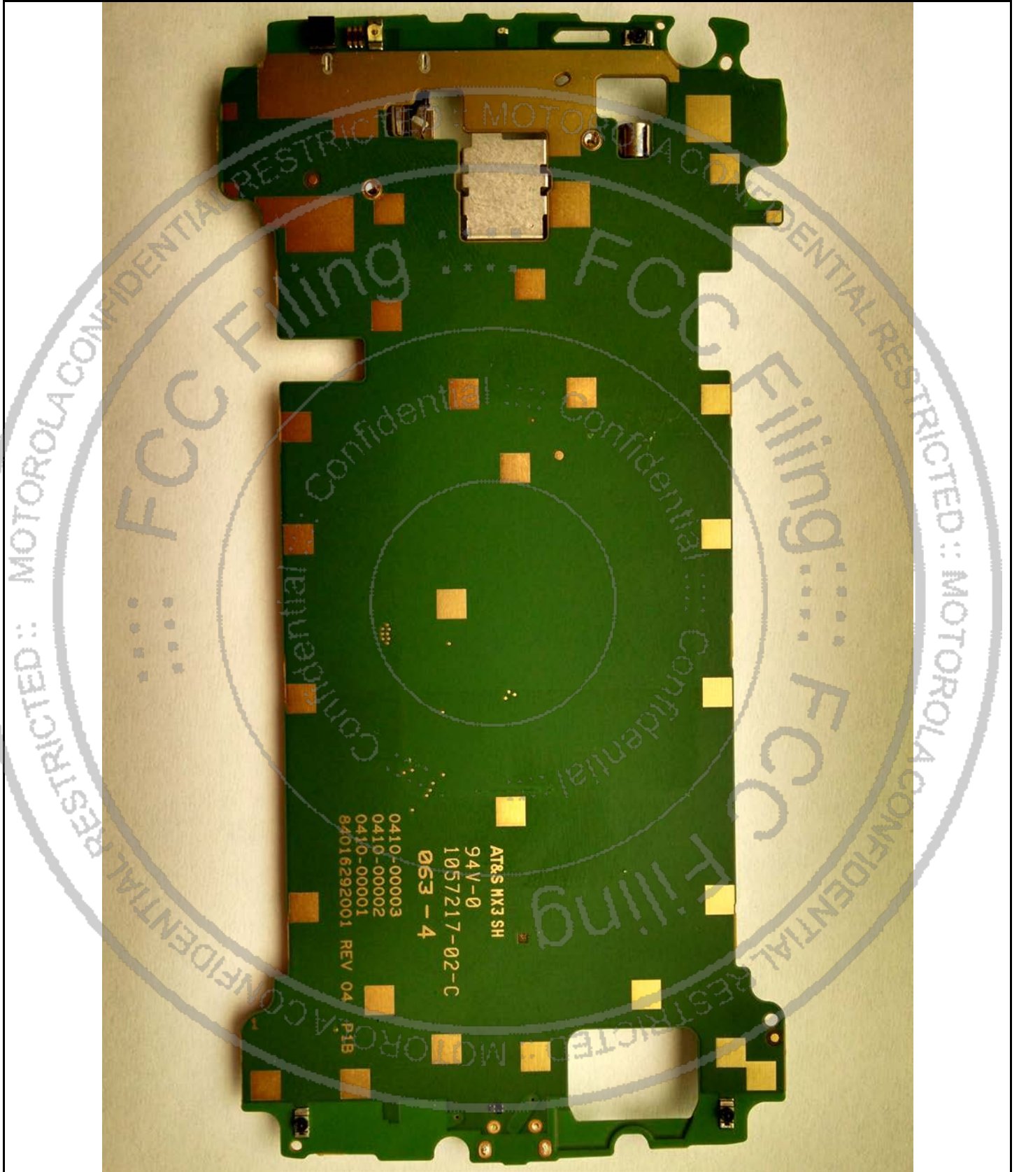
Photograph 9-3: Back side view of the device's PC Board.