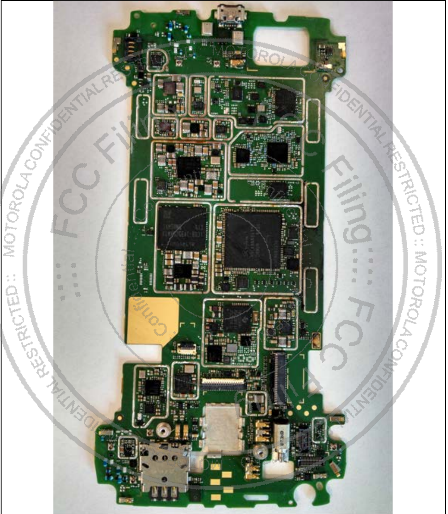
Photograph 9-2: Front side view of the device's PC Board, Shields Removed.