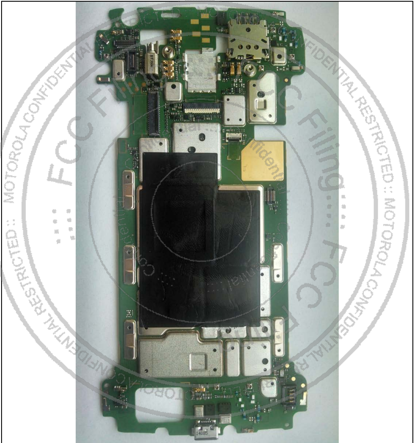
Photograph 9-1: Front side view of the device's PC Board, Shields in place.