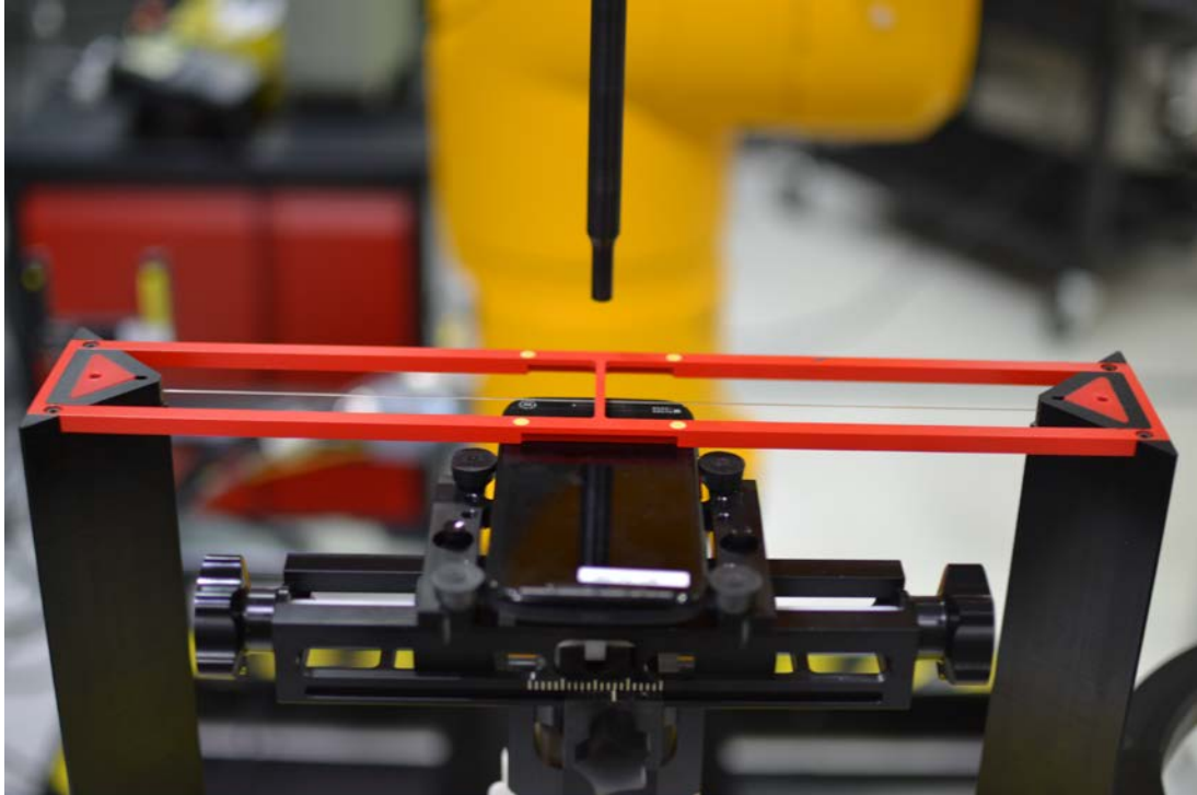
Figure 18-1 Ear Reference Point HAC Phantom Alignment