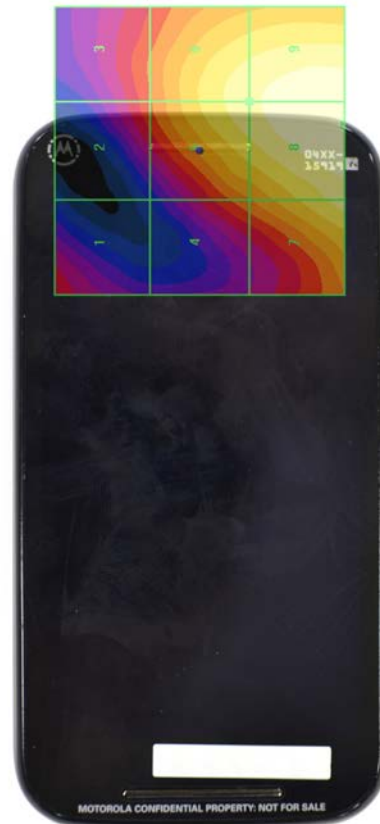
Figure 18-4 E-Field WD Scan overlay