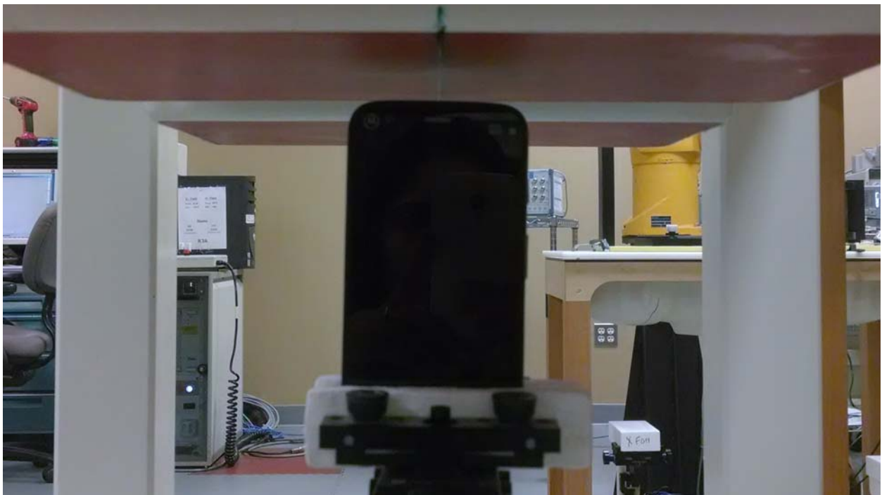
Figure 9: Mobile Hotspot Position, Short Edge of Phone facing Phantom (10 mm separation)