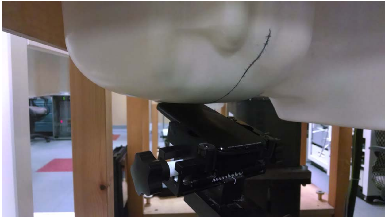
Figure 5: Tilt Position, Front of Head of Phantom