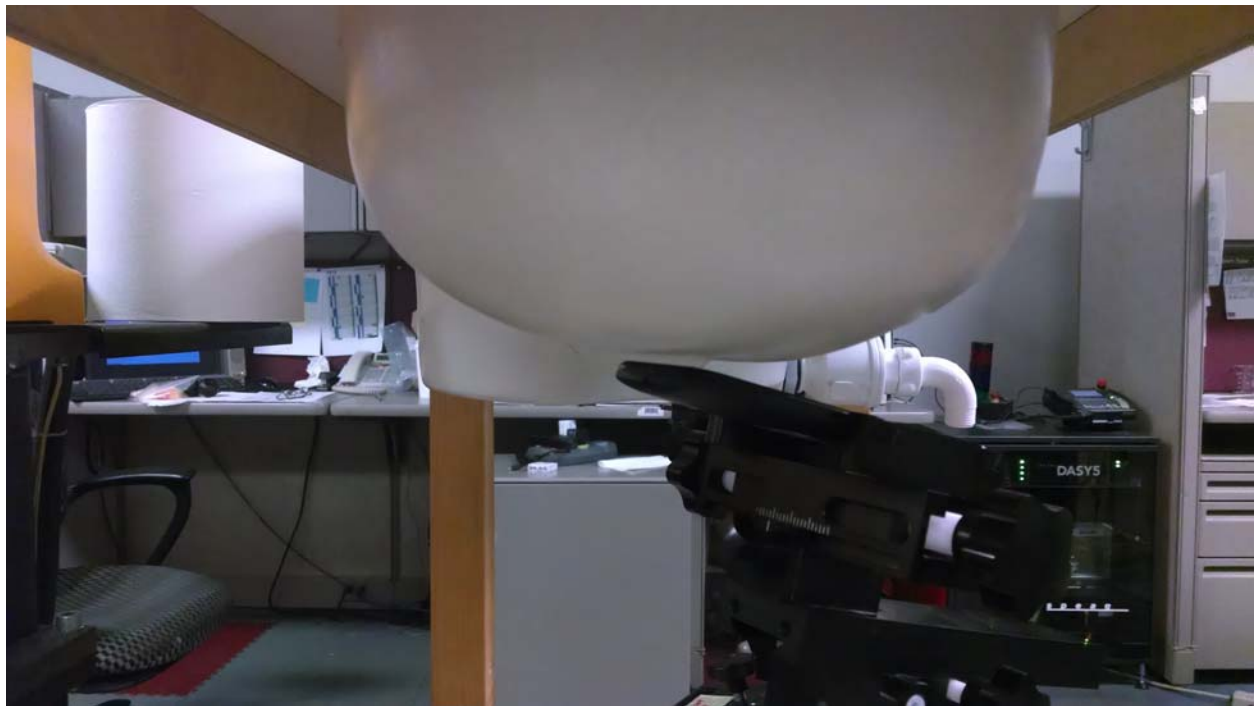
Figure 6: Tilt Position, Top of Head of Phantom