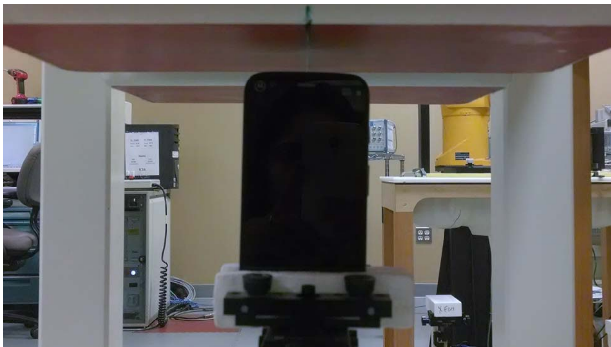
Figure 9: Mobile Hotspot Position, Short Edge of Phone facing Phantom (10 mm separation)