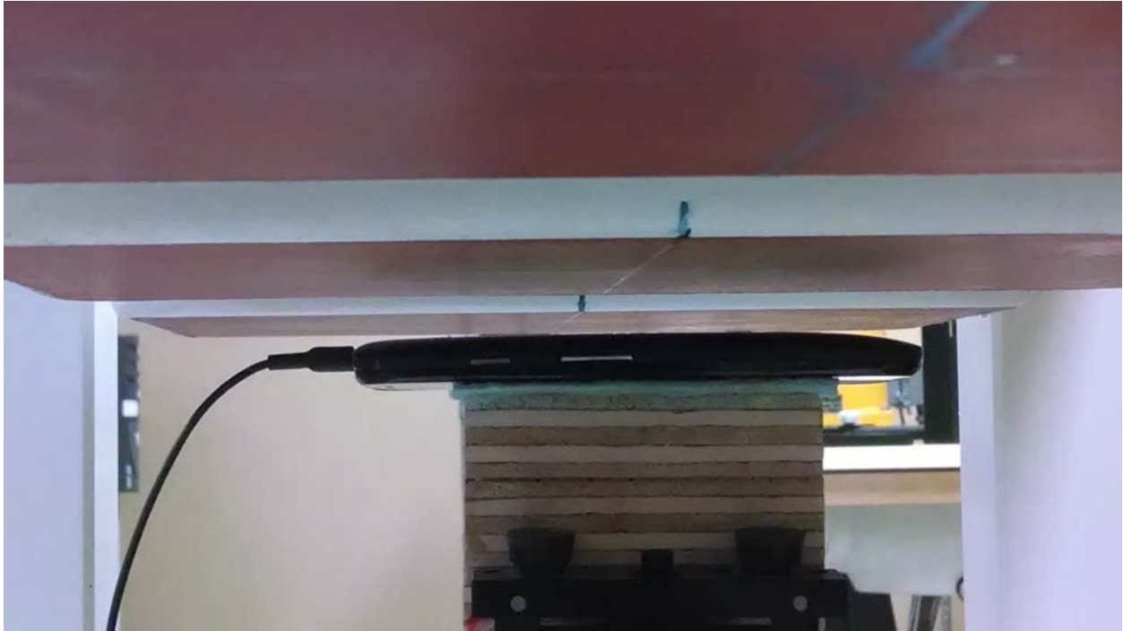
Figure 7: Body Position (15 mm separation, with audio cable shown)