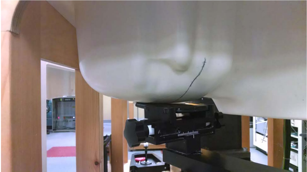
Figure 3: Cheek Position, Front of Head of Phantom