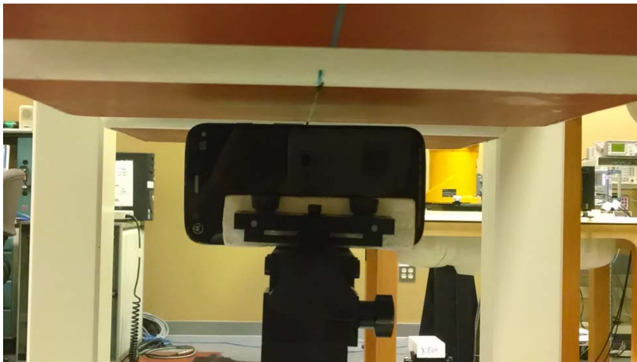
Figure 8: Mobile Hotspot Position, Long Edge of Phone facing Phantom (10 mm separation)