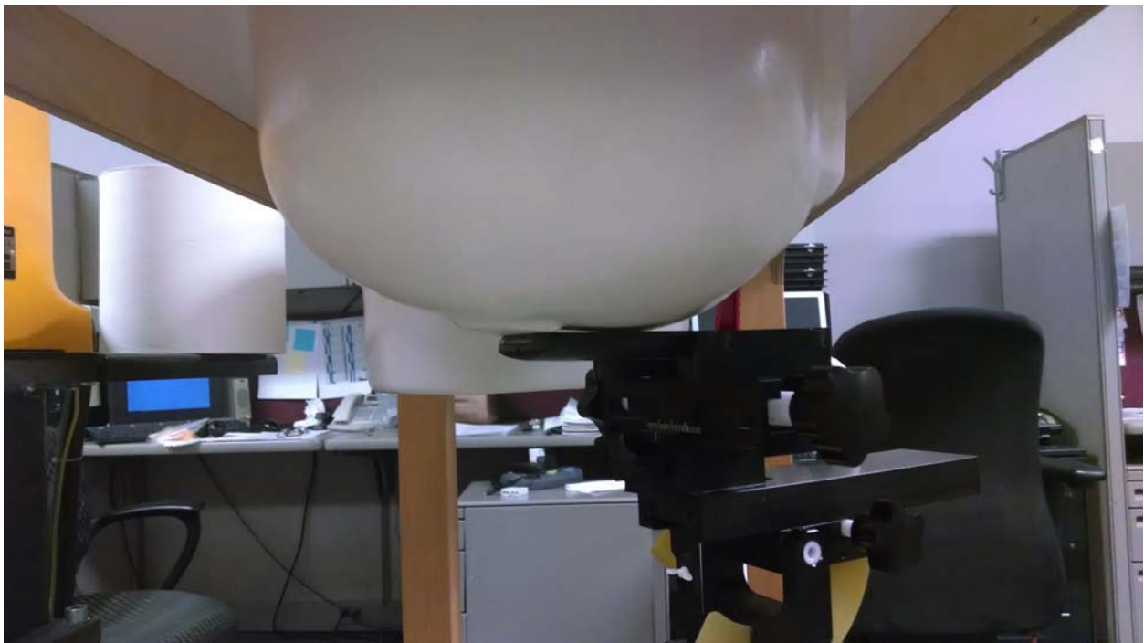
Figure 4: Cheek Position, Top of Head of Phantom