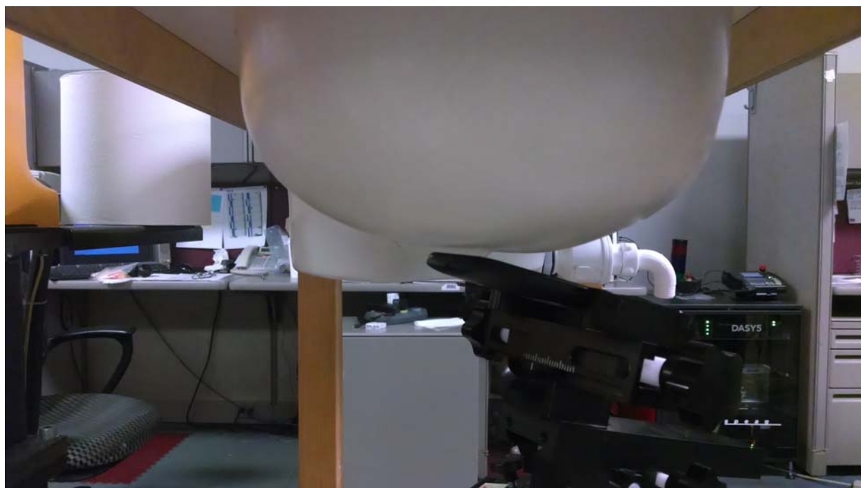
Figure 6: Tilt Position, Top of Head of Phantom