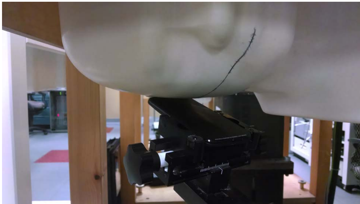
Figure 5: Tilt Position, Front of Head of Phantom