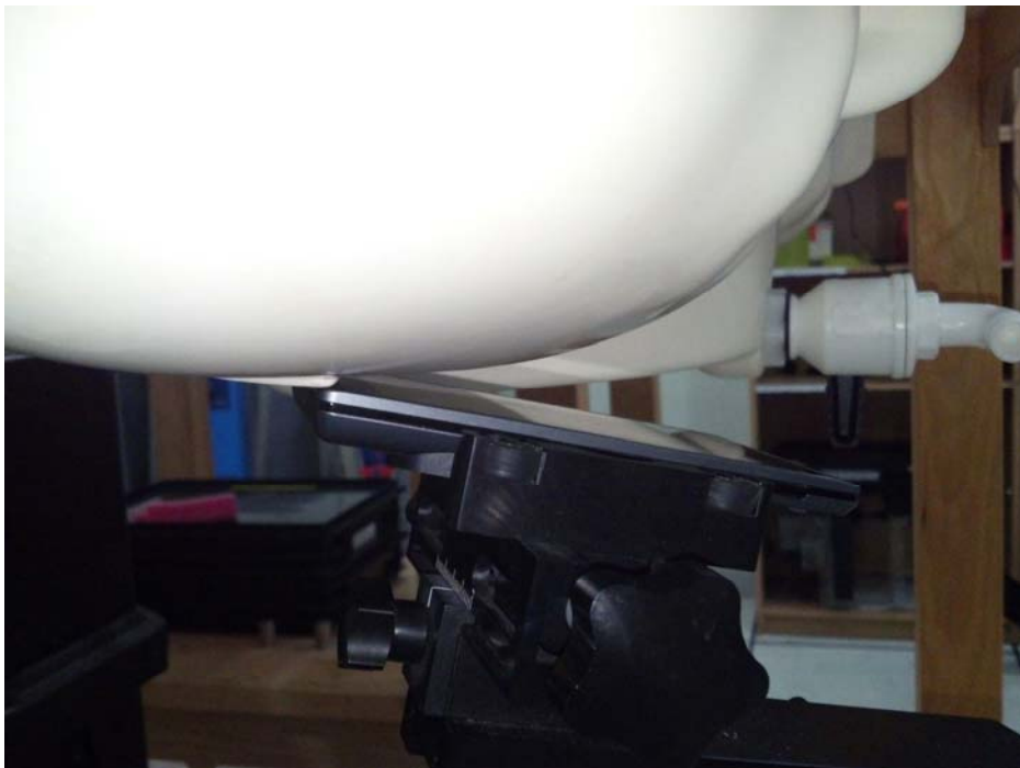
Figure 3: Tilt Position