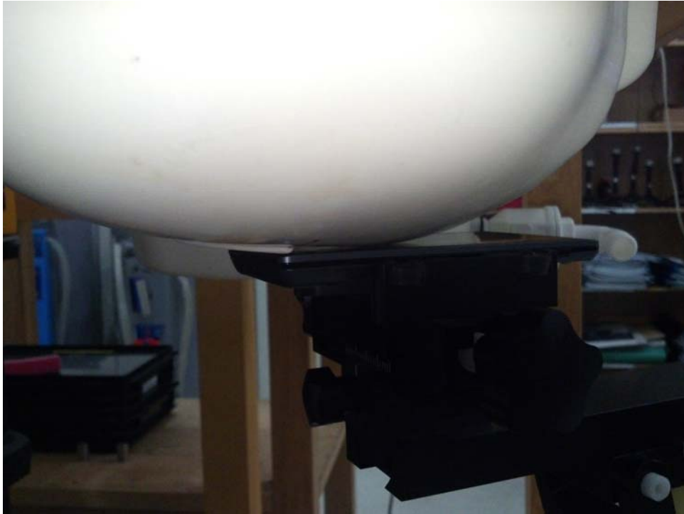
Figure 2: Cheek Position