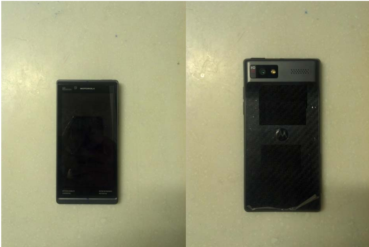
Figure 1: Phone Front and Back