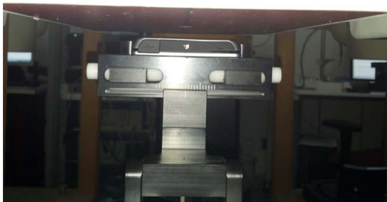
Figure 5: Mobile Hotspot Position, Back of Phone facing Phantom (10 mm separation)