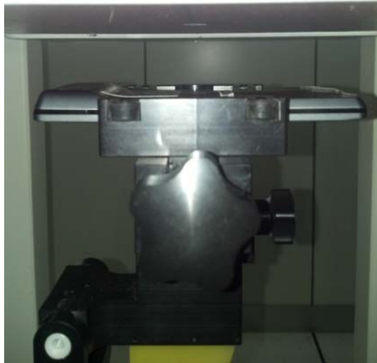
Figure 4: Body Position (25 mm separation)