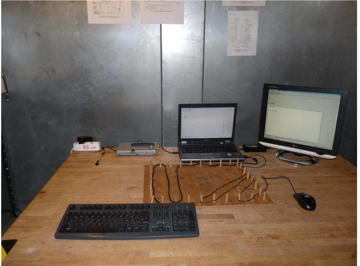
Setup for conducted emissions AC mains