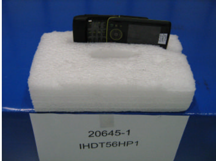
Radiated Emissions Y-Axis