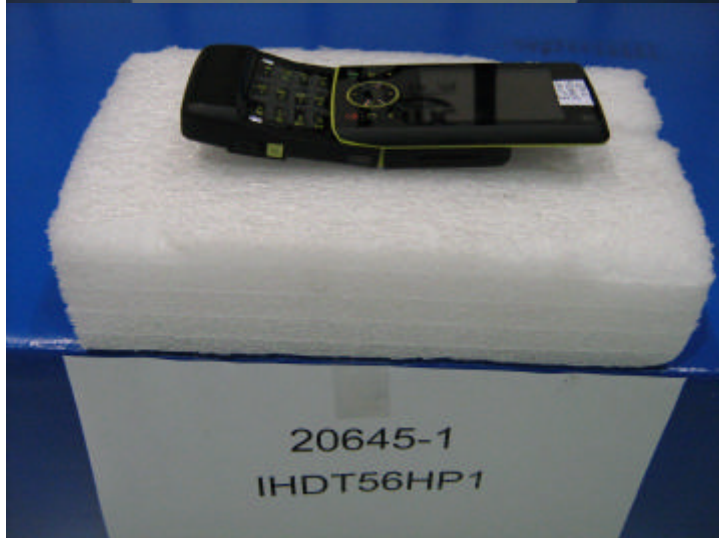
Radiated Emissions Z-Axis