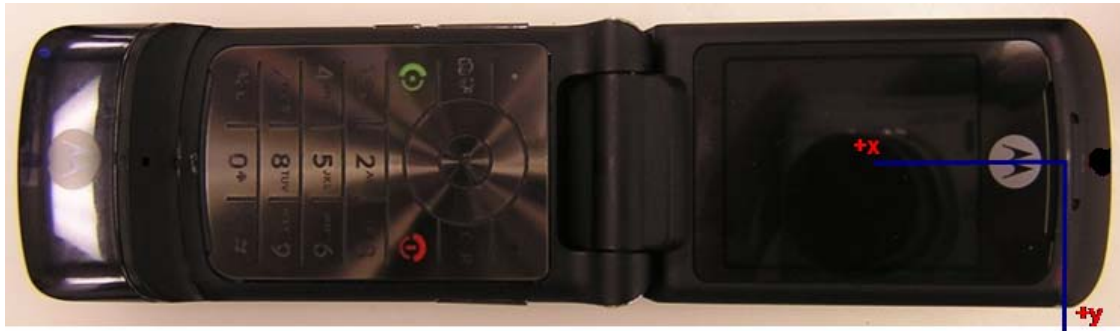
Figure A4-2. Phone Open – Coordinate Axis for T-coil Measured Point Location