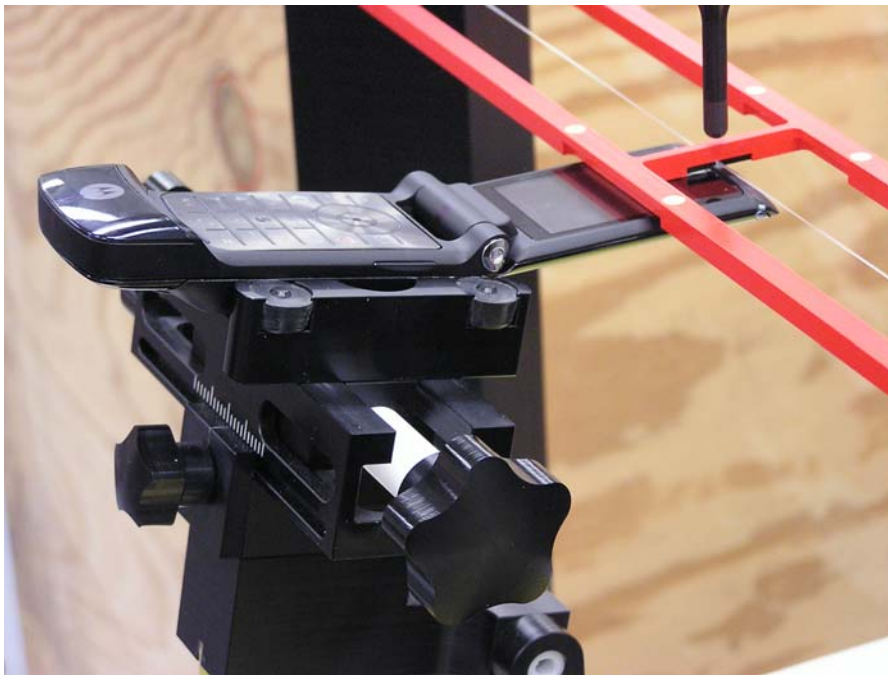
Figure A6-4. Views from the side