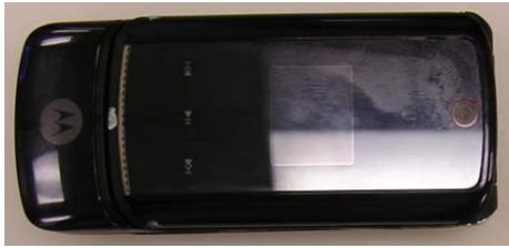
Figure A6-1. Phone Closed