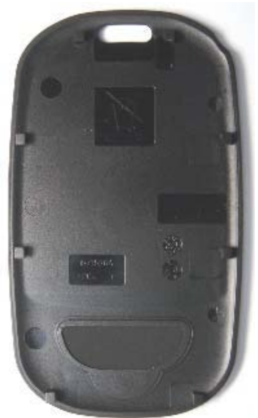
Housing Internal Views