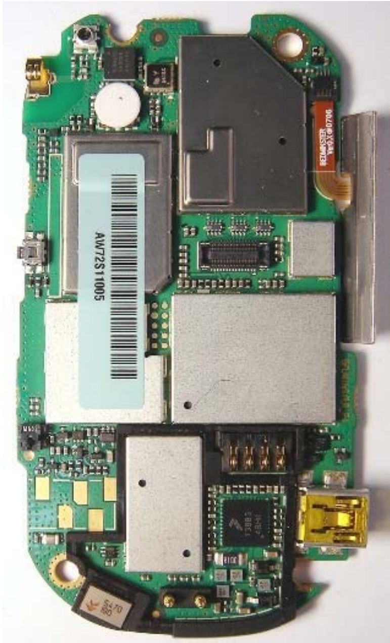
Rear View (Shields On)