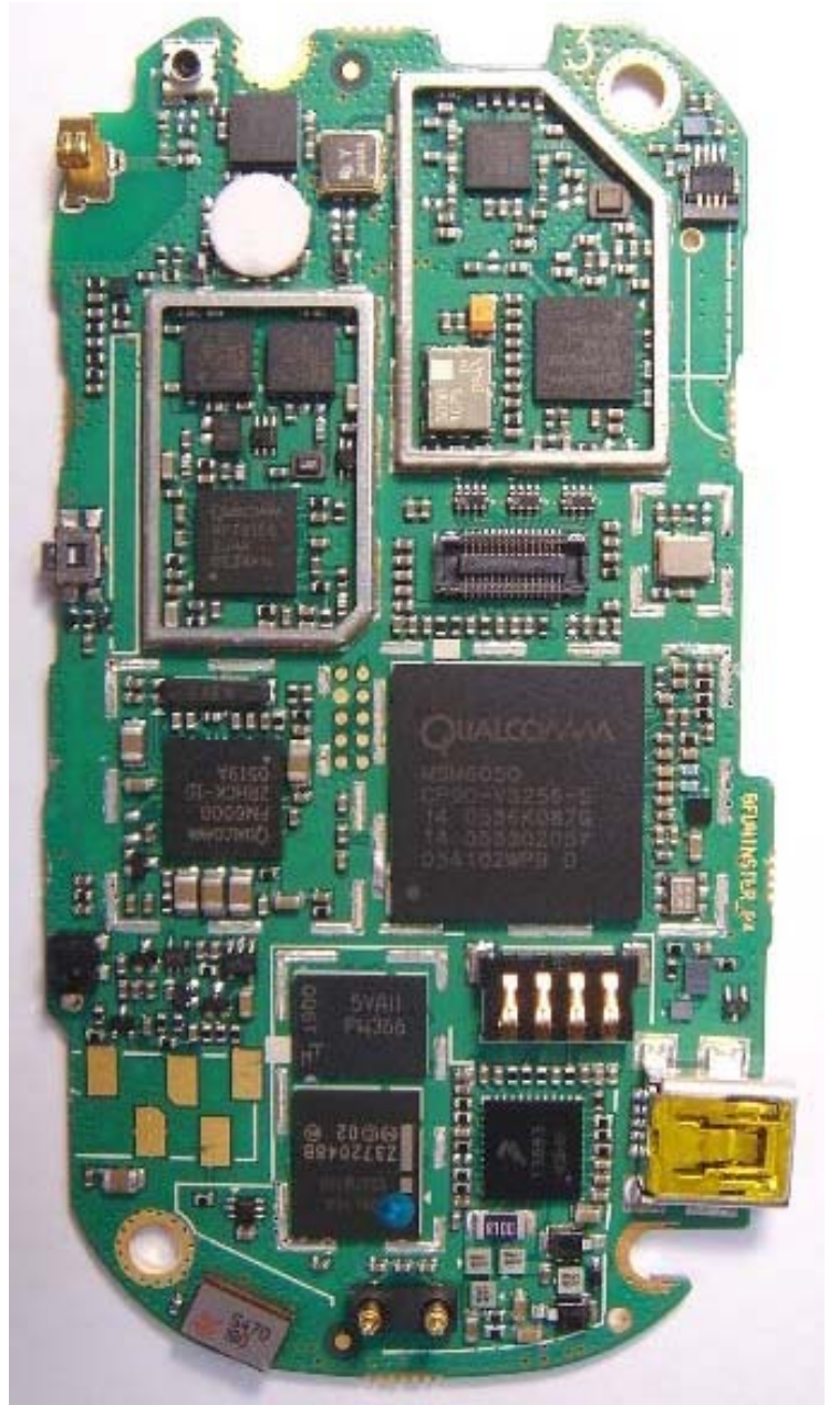
Rear View (Shields Off)