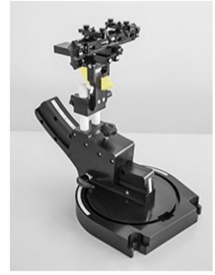
Mounting Device for Hand-Held Transmitters

In combination with the Twin SAM V5.0/V5.0c or ELI phantoms, the Mounting Device for Hand-Held Transmitters enables rotation of the mounted transmitter device to specified spherical coordinates. At the heads, the rotation axis is at the ear opening. Transmitter devices can be easily and accurately positioned according to IEC 62209-1, IEEE 1528, FCC, or other specifications. The device holder can be locked for positioning at different phantom sections (left head, right head, flat). And upgrade kit to Mounting Device to enable easy mounting of wider devices like big smart-phones, e-books, small tablets, etc. It holds devices with width up to 140 mm.