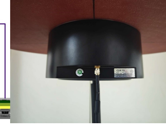
Fig 8.3.1 System Performance Check Setup