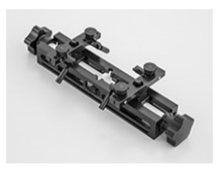
Mounting Device Adaptor for Wide-Phones