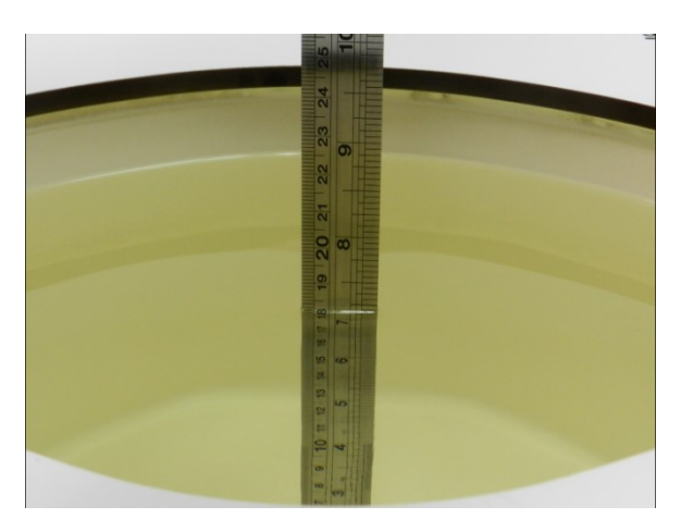
Fig 11.1 Photo of Liquid Height for Body SAR

For the measurement of the field distribution inside the SAM phantom with DASY, the phantom must be filled with around 25 liters of homogeneous body tissue simulating liquid. For body SAR testing, the liquid height from the center of the flat phantom to the liquid top surface is larger than 15 cm, which is shown in Fig. 11.1.