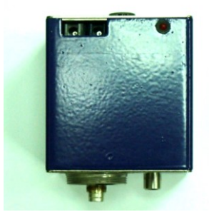
Fig 5.1 Photo of DAE

The input impedance of the DAE is 200 MOhm; the inputs are symmetrical and floating. Common mode rejection is above 80 dB.