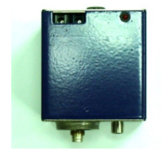
Fig 5.1 Photo of DAE

The input impedance of the DAE is 200 MOhm; the inputs are symmetrical and floating. Common mode rejection is above 80 dB.