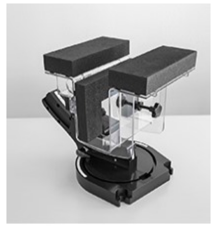
Mounting Device for Laptops

The extension is lightweight and made of POM, acrylic glass and foam. It fits easily on the upper part of the mounting device in place of the phone positioned. The extension is fully compatible with the SAM Twin and ELI phantoms.