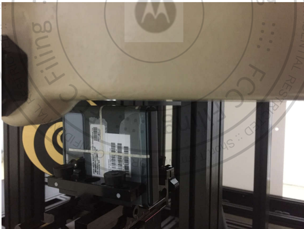
Left Side (5mm)