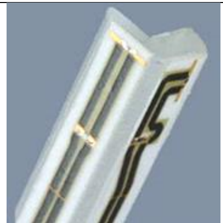
Photo of E-field Probe