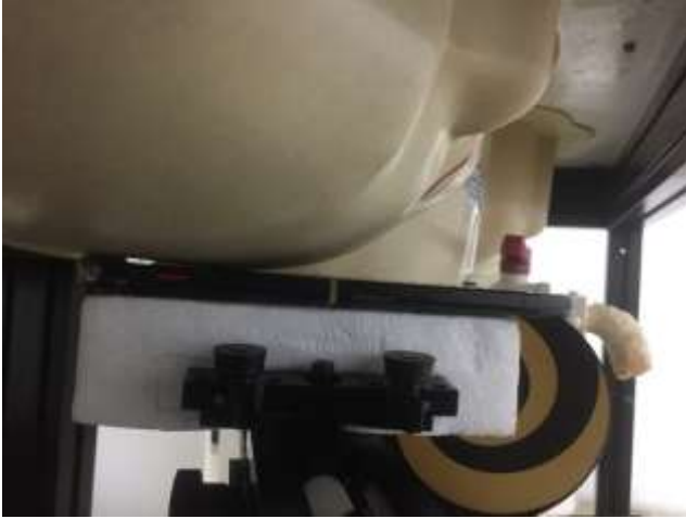
Right Cheek at 0mm