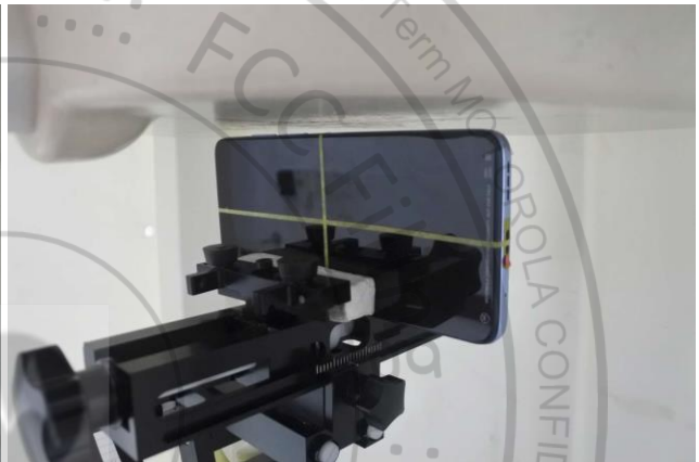
Right Side, Test Separation 5 mm