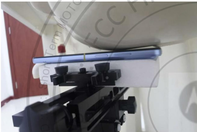
Left Cheek, Test Separation 0 mm