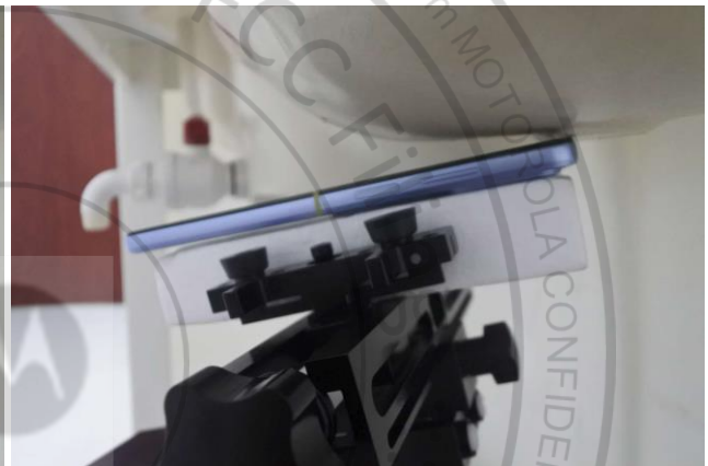
Left Tilted, Test Separation 0 mm