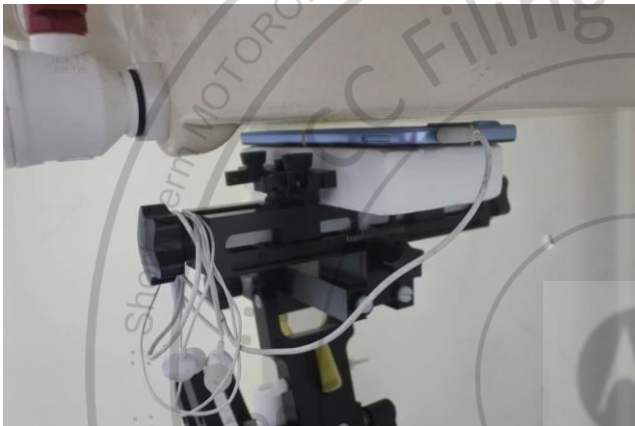
Back with headset, Test Separation 5 mm