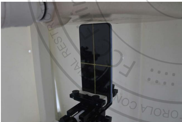
Top Side, Test Separation 5 mm