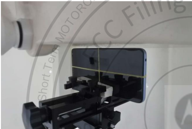
Left Side, Test Separation 5 mm