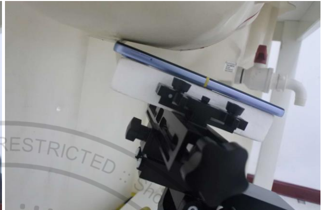
Right Tilted, Test Separation 0 mm