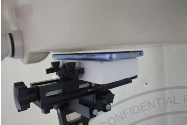
Front, Test Separation 5 mm