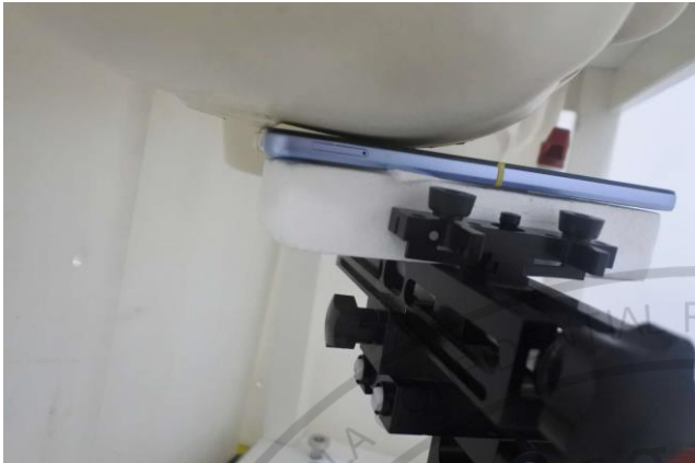
Right Cheek, Test Separation 0 mm