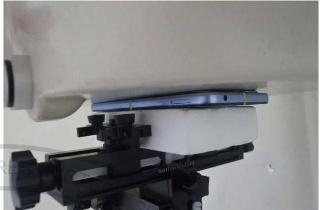
Back, Test Separation 0 mm