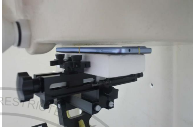
Back, Test Separation 5 mm