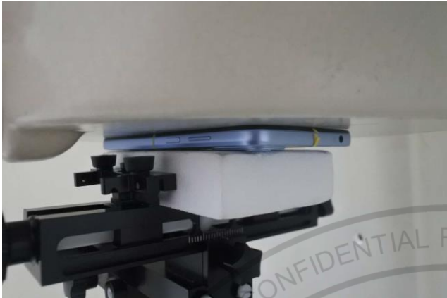
Front, Test Separation 0 mm