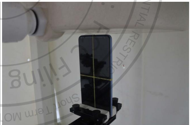
Bottom Side, Test Separation 5 mm