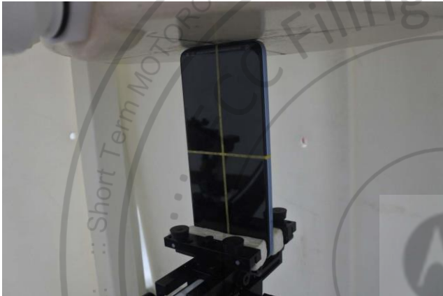
Bottom Side, Test Separation 0 mm