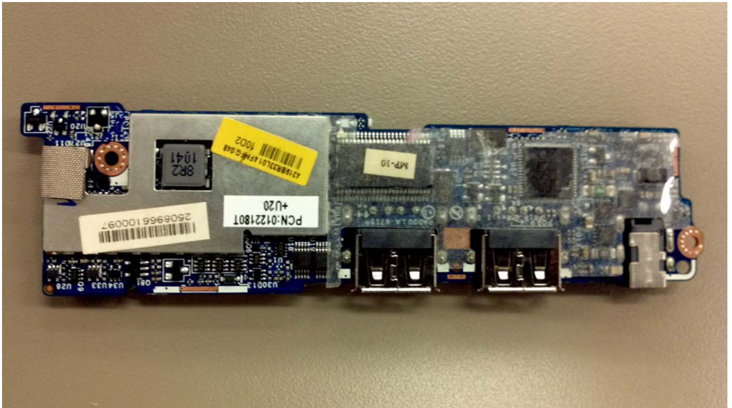
Photograph 7: Main Board, Bottom Side.