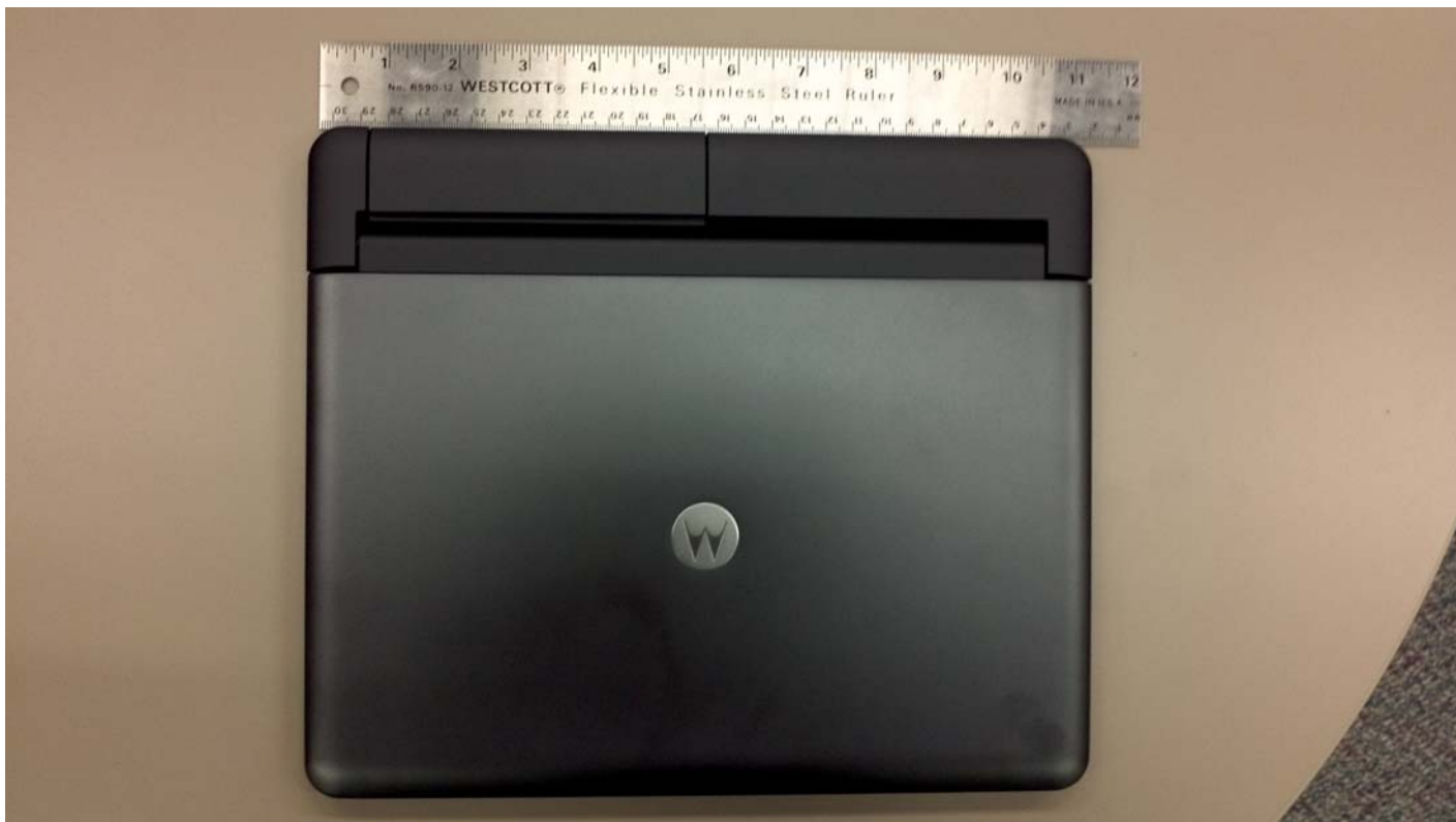
Photograph 1: Top View of Lapdock Accessory, Mounting Plate Closed.