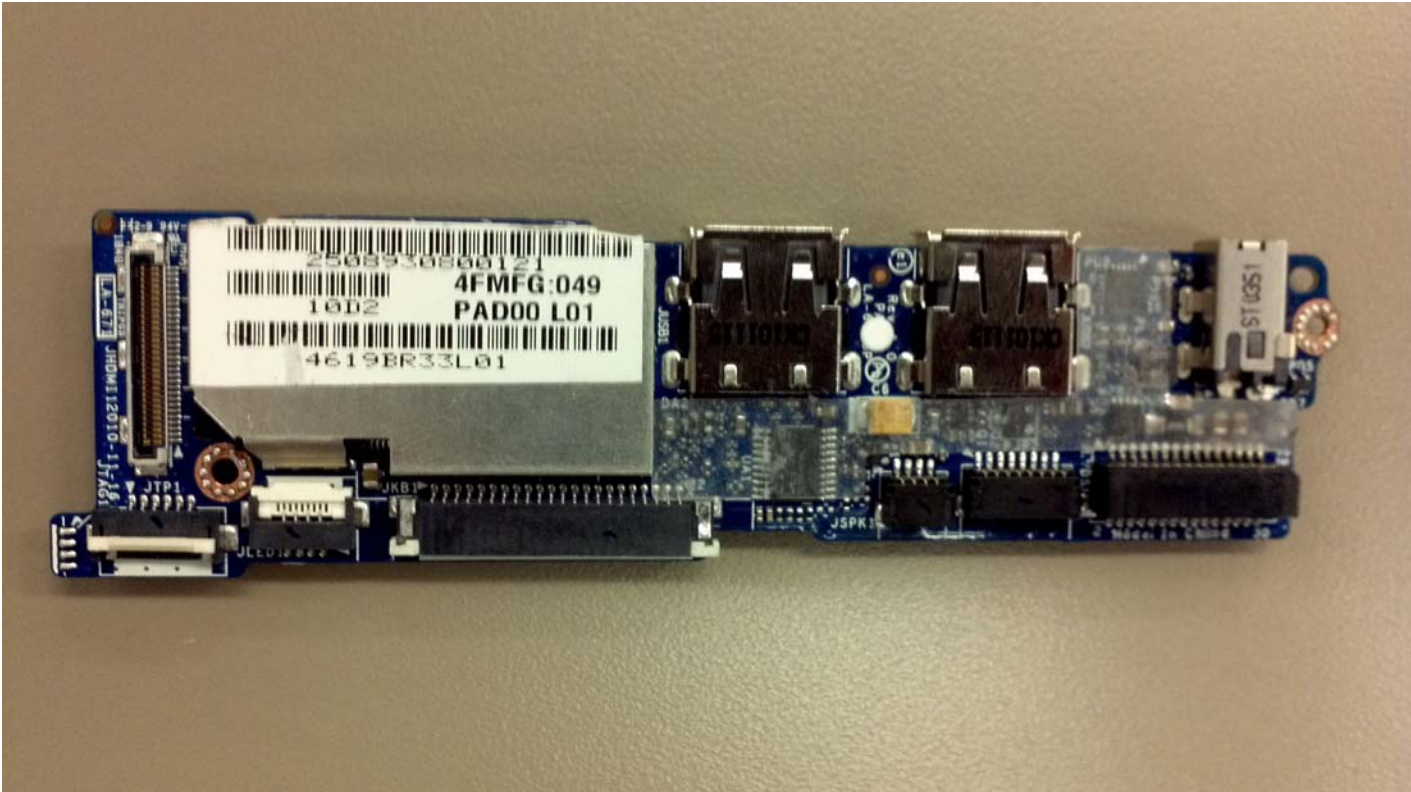
Photograph 6: Main Board, Top Side.