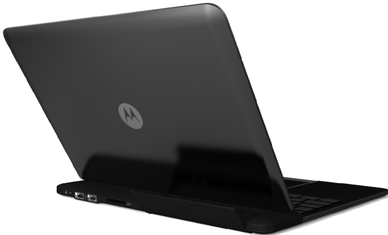
Photograph 2: Three-Quarter View, Showing Ports and Docking Plate.