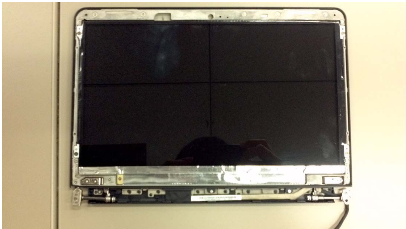
Photograph 3: Display Portion.