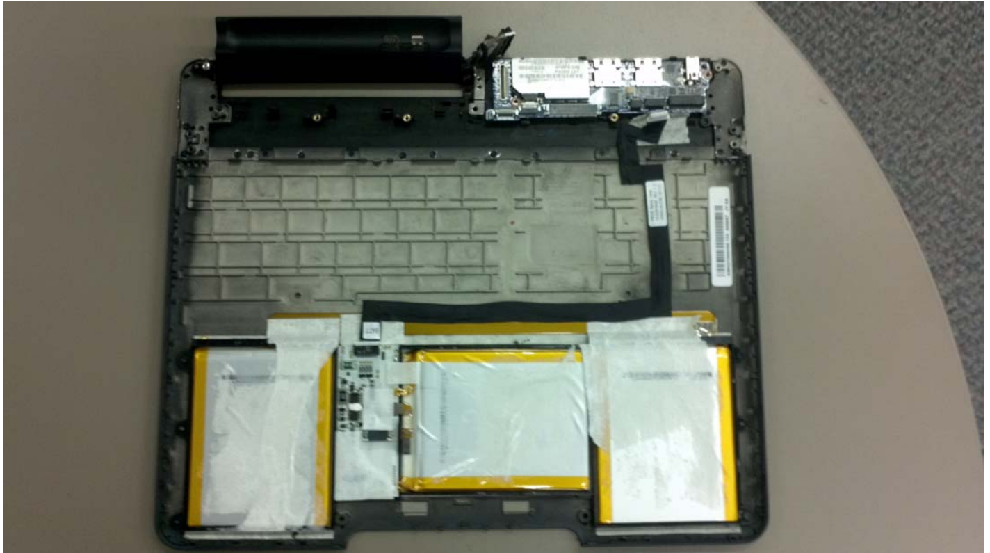
Photograph 4: Base Portion, with Display/Keypad Removed. Battery Pack/Safety Circuit at Lower Edge.