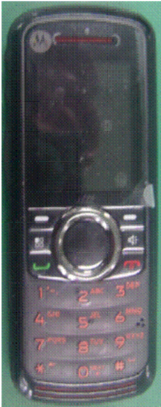
Figure 3-1. Front of radio

The radio product shapes, colors and housings/bezels may vary.