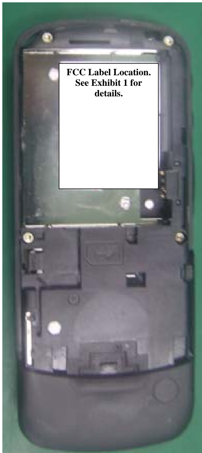
Figure 3-7. Interior Compartment of radio