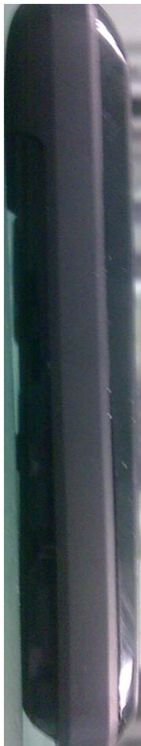
Figure 3-4. Opposite Side of radio