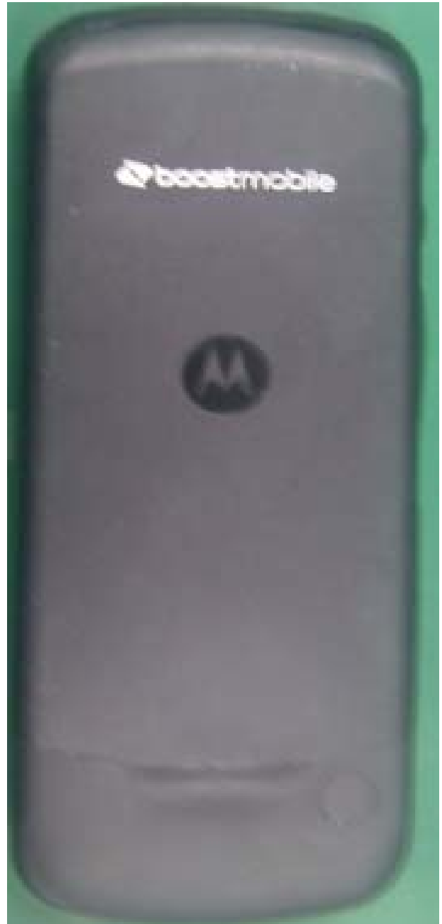
Figure 3-2. Back of radio