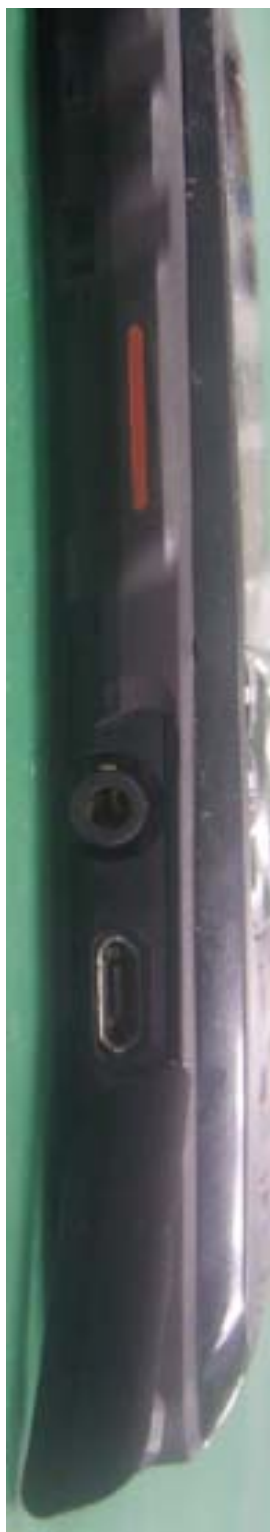
Figure 3-3. Button Side of radio (connectors exposed)