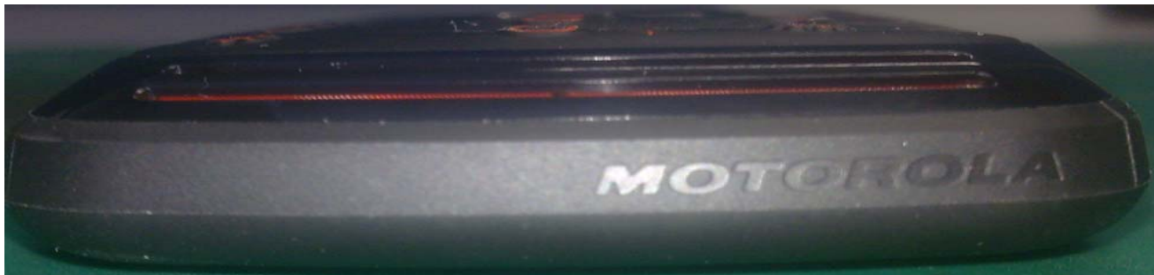
Figure 3-5. Top of radio