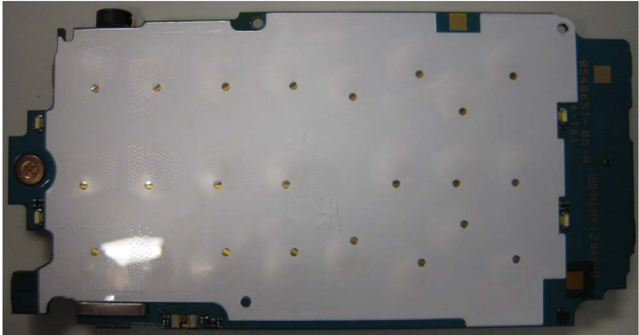
Photograph 9-3: Keypad side of radio product PC Board.